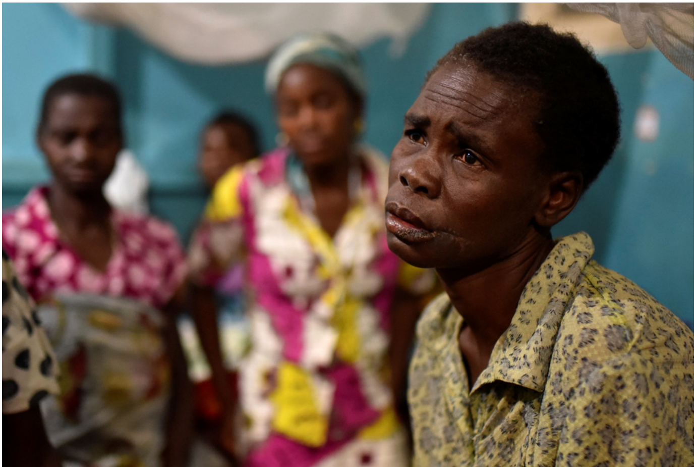
A victim of ethnic violence rests inside a hospital on June 25 in Bunia, Congo.

"We do have the opportunity to do [go to detention centers]. But the centers are at very high capacity. And there are a lot of people with so many needs. Even asylum claimers are in detention, which shouldn't be like that, but that's the policy," she said.