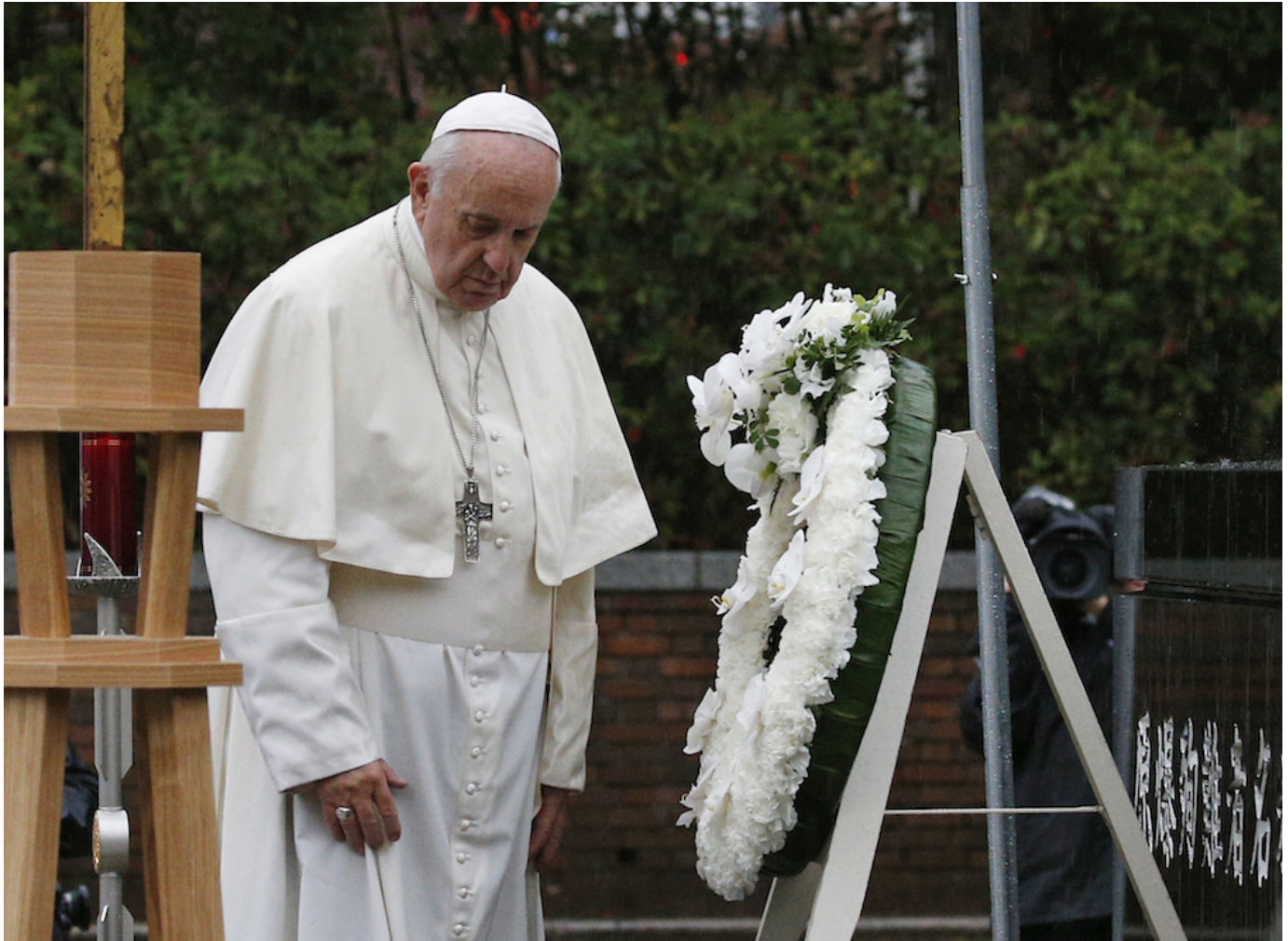
Pope Francis finishes praying at the Atomic Bomb Hypocenter Park in Nagasaki, Japan, Nov. 24.

Thinking that developing, stockpiling and modernizing nuclear weapons is a deterrent to war provides only a "false sense of security," the pope said. What is more, it feeds fear and mistrust, which hinder dialogue.