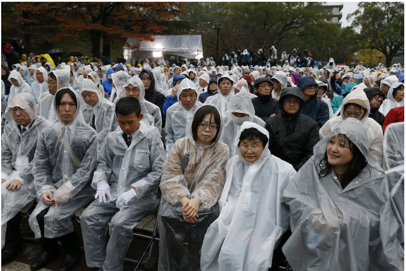
People attend Pope Francis' visit to the Atomic Bomb Hypocenter Park in Nagasaki, Japan, Nov. 24.

The use of nuclear weapons is not the only threat the arms pose, he said, pointing to the billions of dollars spent each year on maintaining nuclear stockpiles and developing new weapons when millions of people are starving and dying in poverty.