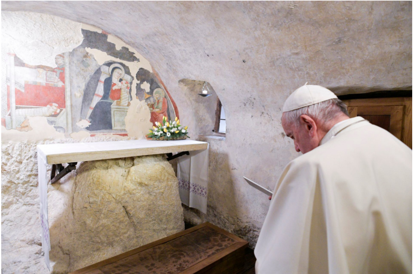
Pope Francis prays during a visit to the Nativity scene of Greccio, Italy, Dec. 1, 2019. The first Nativity scene was assembled in Greccio by St. Francis of Assisi in 1223.