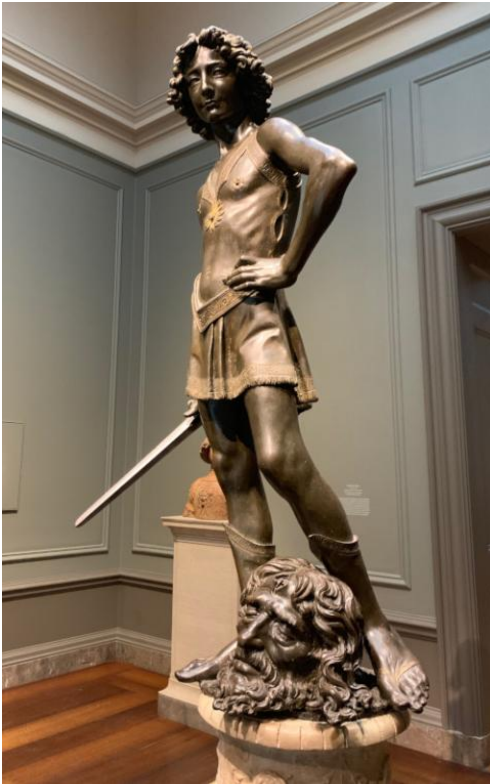
"David with the Head of Goliath," circa 1465, by Andrea del Verrocchio, in bronze with partial gilding at the Museo Nazionale del Bargello in Florence, Italy