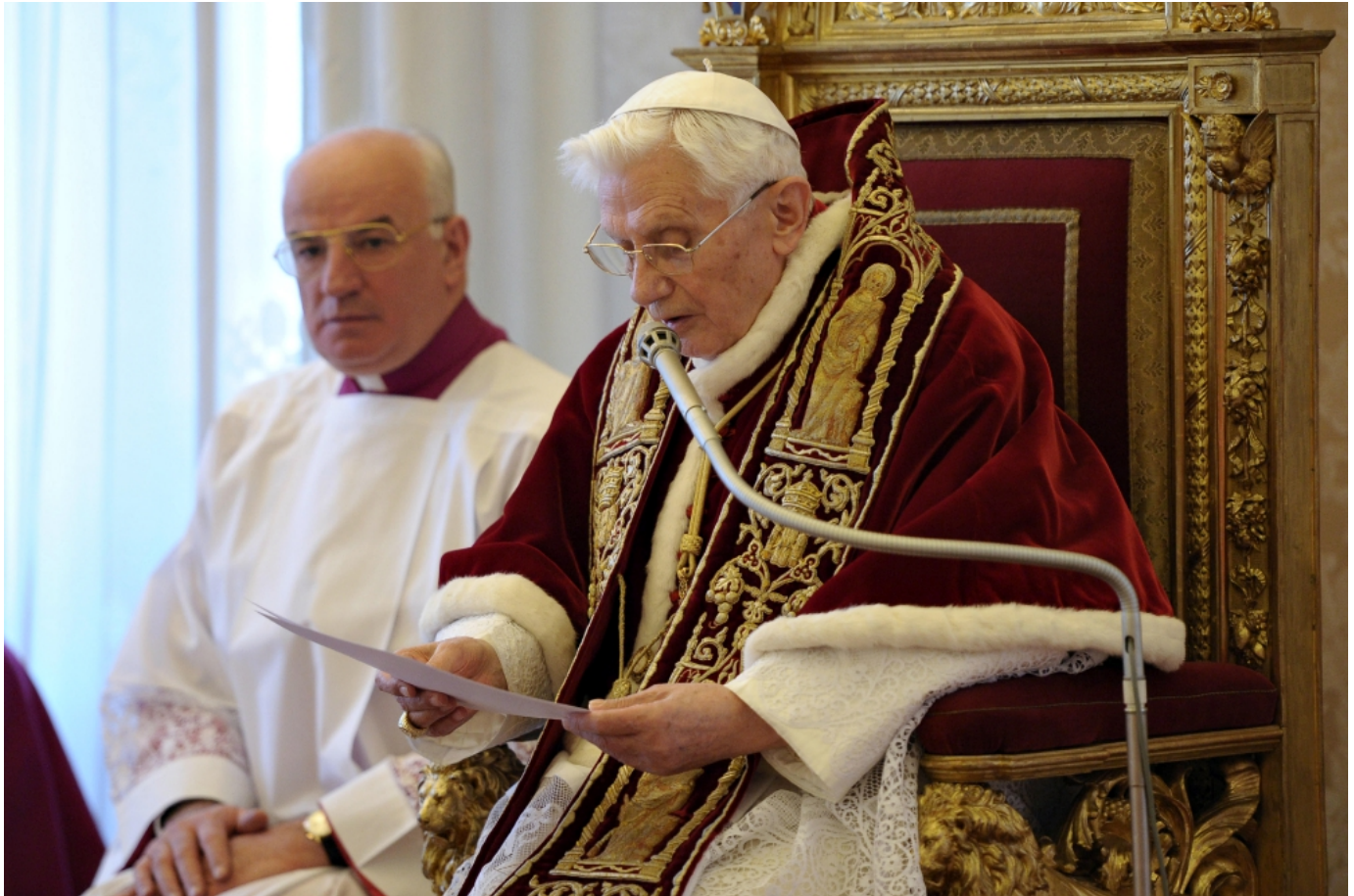
Pope Benedict XVI reads his resignation in Latin during a meeting of cardinals at the Vatican on Feb. 11, 2013.