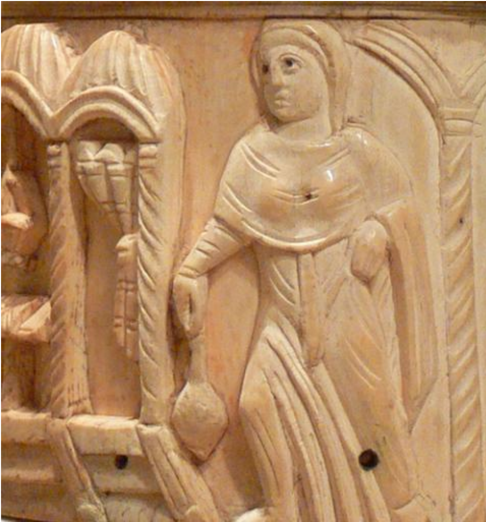
Detail of an ivory pyx (box for holding the Eucharist) showing women at the altar of the Church of the Resurrection, also called the Anastasis, in Jerusalem, circa 500s A.D. (Metropolitan Museum of Art)

But Kateusz overlooks a persuasive alternative explanation suggested by one of her own sources, the distinguished Byzantine scholar Alexei Lidov, who cites a decree by the sixth-century church council in Auxerre, France: "Women must not accept the Holy Host on a bare hand," and, "All women must have a dominicale (white cloth) to go to communion." He notes these regulations "fixed an ancient and, evidently widespread practice," and "demonstrated the particular piety of women." Sadly, these rules also reveal the increasing hierarchical restriction of female proximity to the sacred.