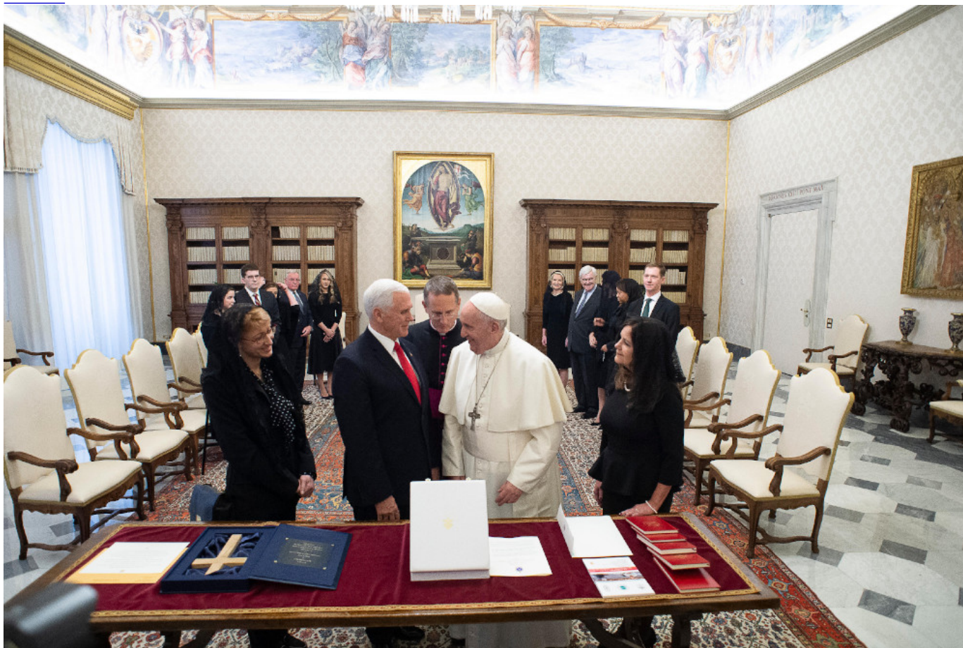
Pope Francis and U.S. Vice President Mike Pence exchange gifts Jan. 24, 2020, at the end of a meeting in the Apostolic Palace at the Vatican.