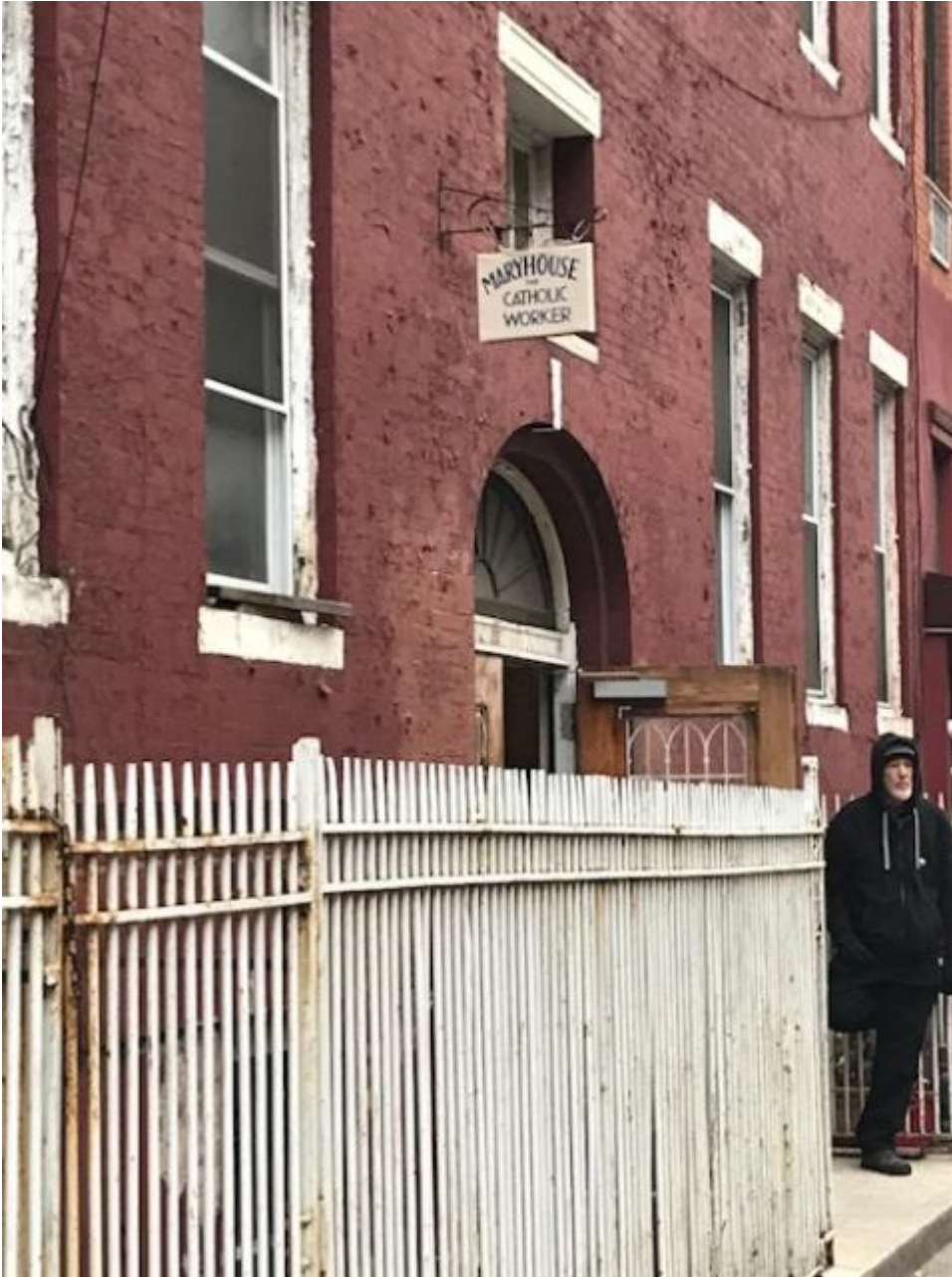
The Catholic Worker Maryhouse shelter and soup kitchen in New York City (Mercedes Gallese)

That legacy is being tested in Day's canonization cause led by the New York Archdiocese, an entity that clashed with Day's militant pacifism in the midst of the Cold War. Day once famously remarked that she didn't want to be considered a saint, because she didn't want to be dismissed that easily.