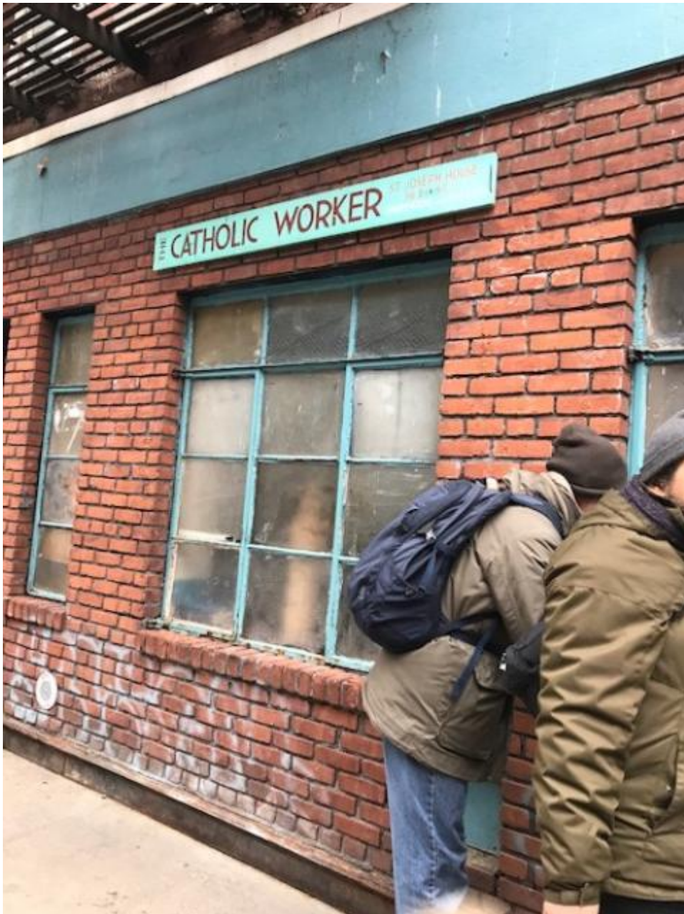
People outside of the Joseph House, part of the Catholic Worker facilities in New York City (Mercedes Gallese)