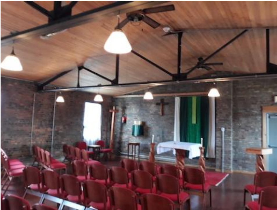
The chapel on the second floor of the Our Lady of the Road center