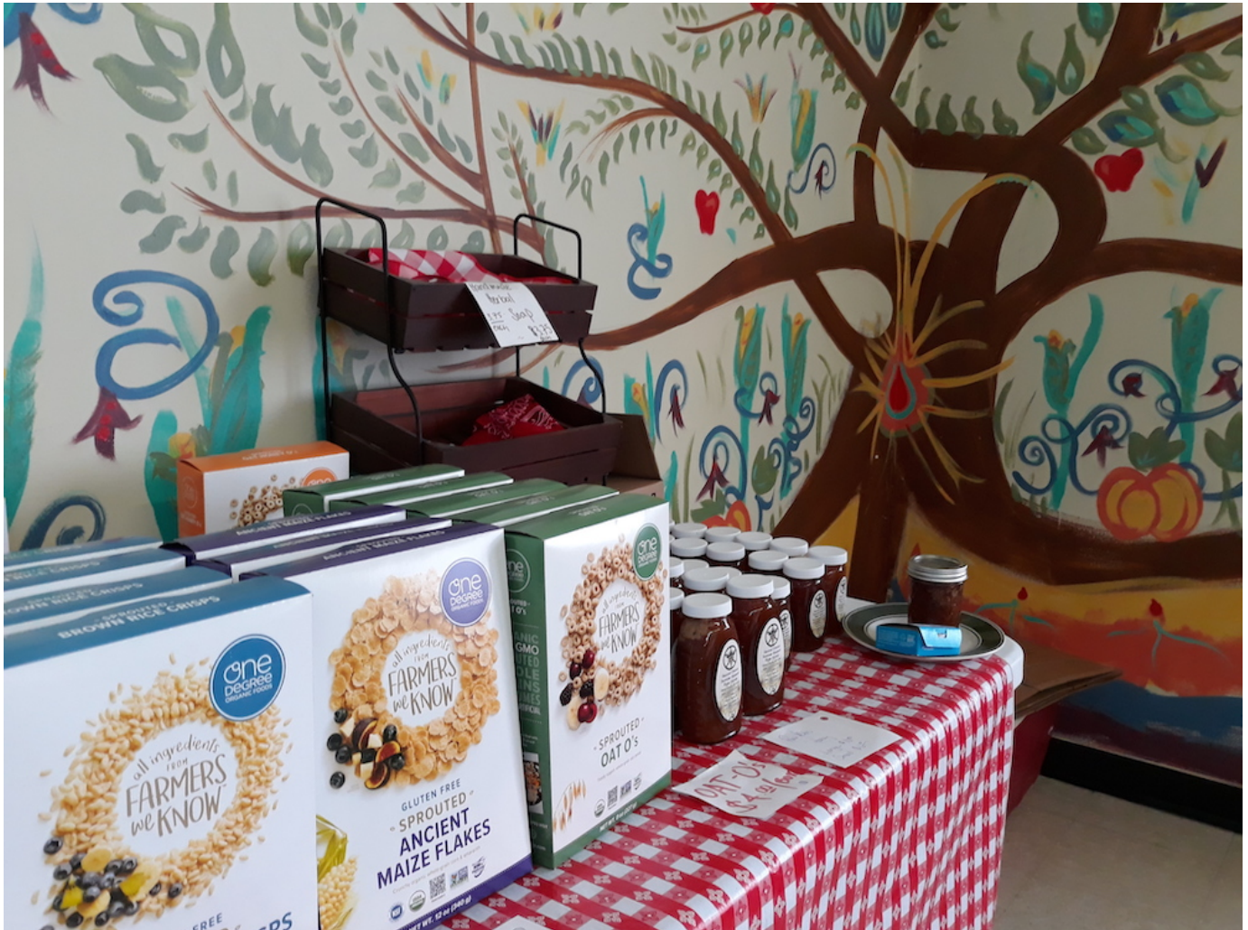
A table in the cooperative grocery store at the Our Lady of the Road drop-in center in South Bend, Indiana

More recently, due to a renovation of the local library, the city requested that Our Lady of the Road also serve as a warming center, which it has done every afternoon this year and will do so through April.