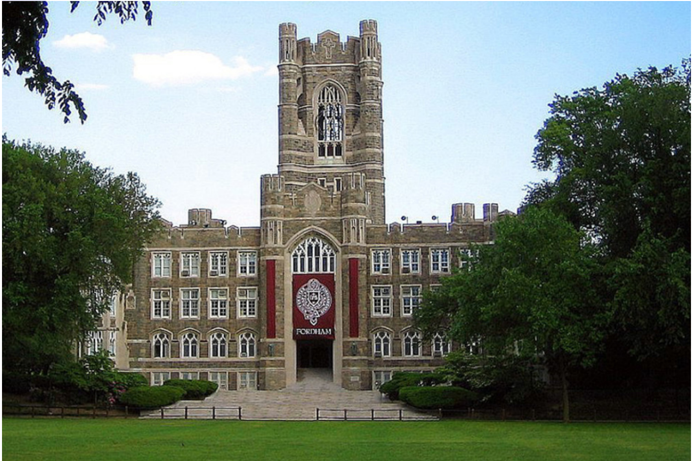
Keating Hall at Fordham University in the Bronx borough of New York.