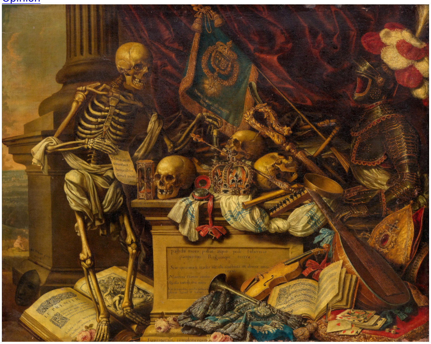
A Memento Mori still life painting by Carstian Luyckx, circa 1650.