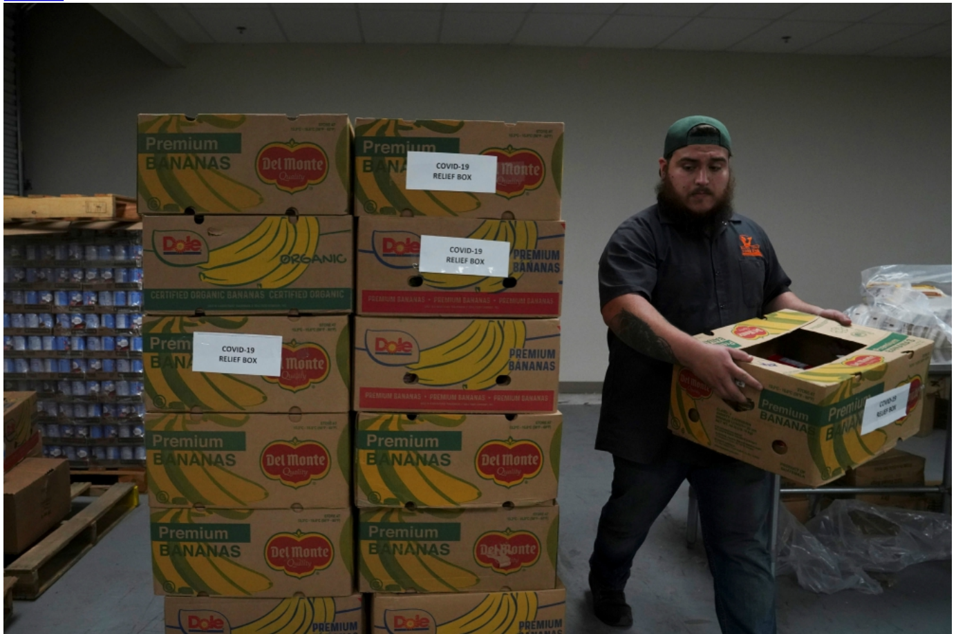
A man in Laredo, Texas, stacks relief boxes at the South Texas Food Bank March 20 during the coronavirus outbreak.