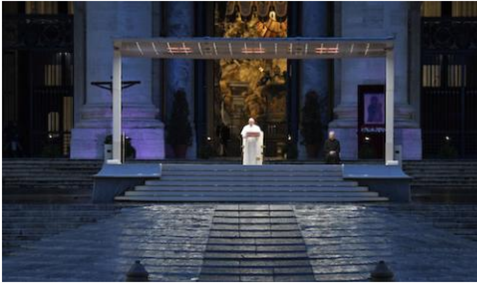
Pope Francis leads a prayer service in an empty St. Peter's Square at the Vatican March 27.

Fortunately, good pastoral sense prevails in many places. Some women religious communities are conducting funeral services without benefit of clergy. A sister dies in a motherhouse, and the leadership team handles the wake, funeral and burial. The leaders, and perhaps a few close friends of the deceased (not to exceed the limits of how many can gather legally in the locale) carry out a dignified celebration of the person's life. After the service, they process to the cemetery for the final prayers and burial. It is livestreamed throughout the motherhouse and to friends and family at a distance, providing as much comfort as possible.