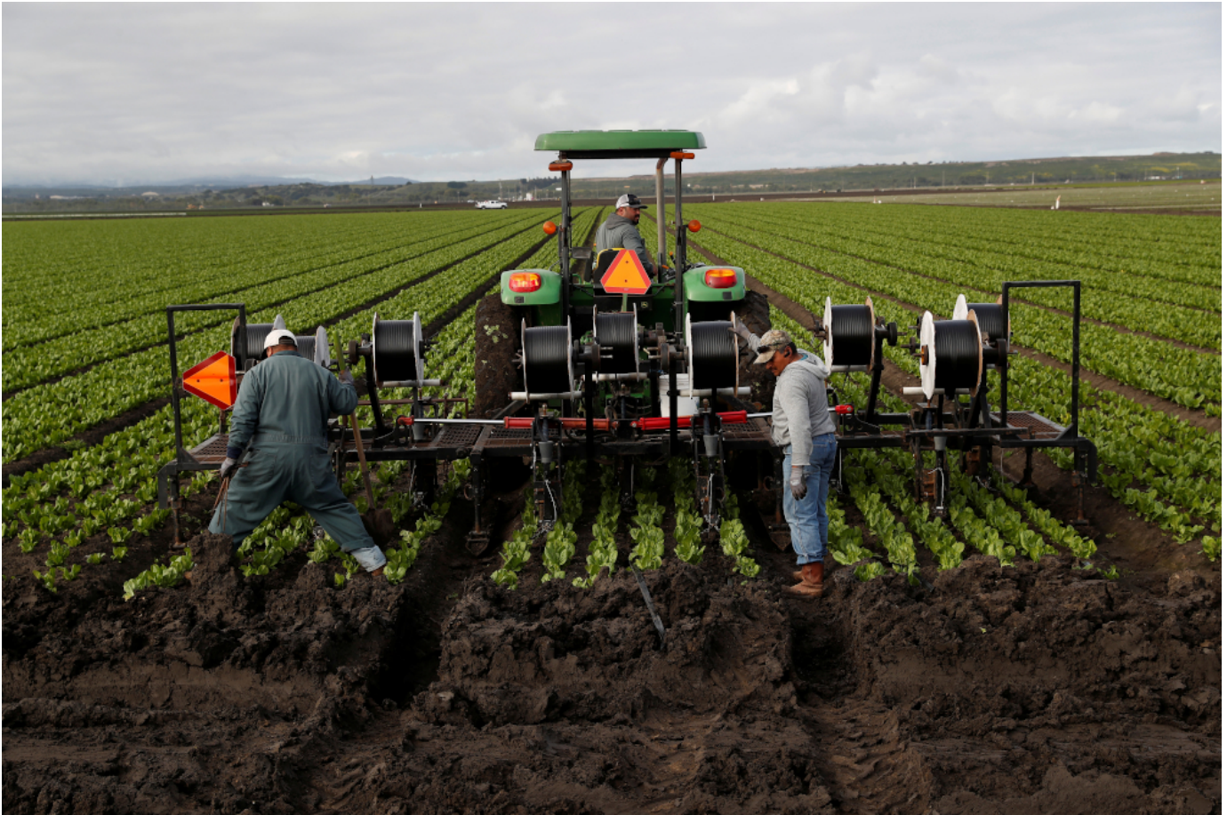
Agricultural workers labor in a Marina, California, field March 30.

gloves, and give them a quick lesson on how to keep safe in the middle of a pandemic.