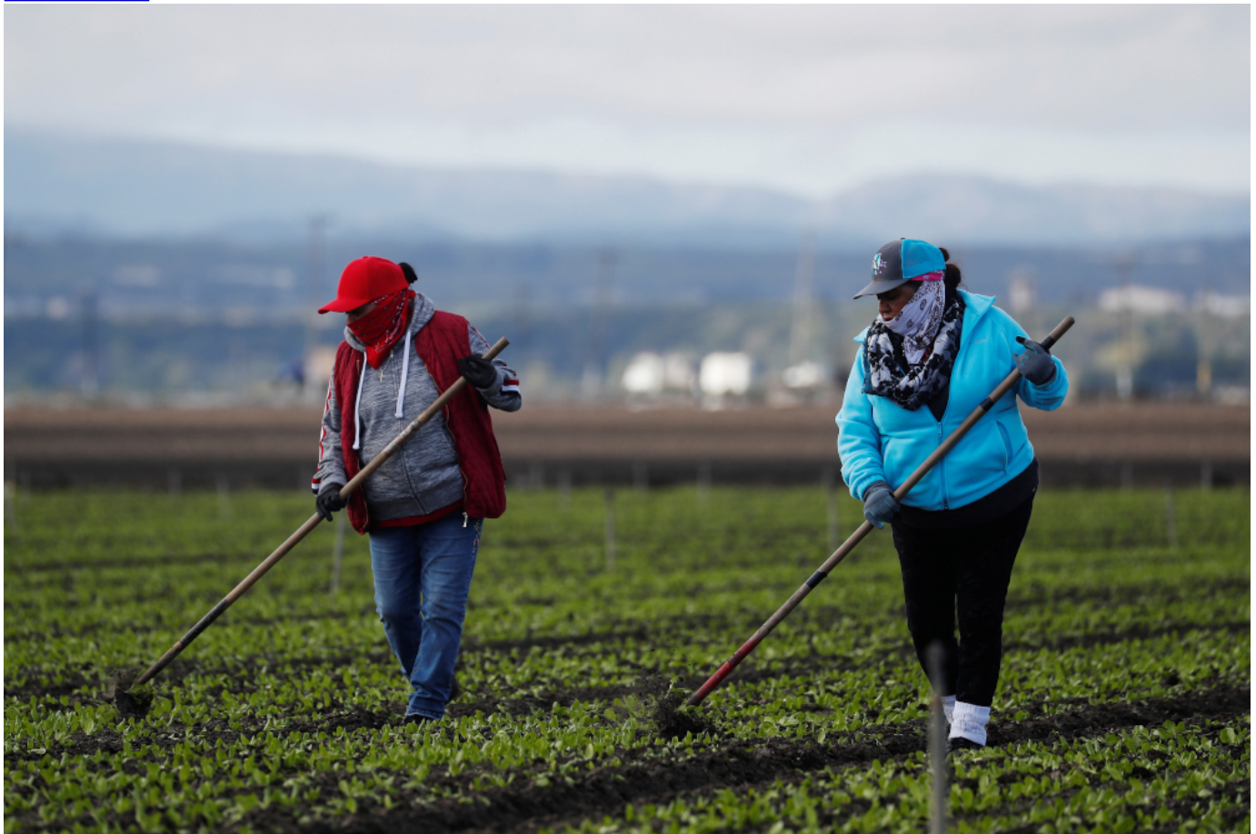
Migrant workers clean fields near Salinas, California, March 30.