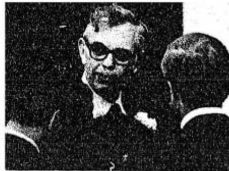
GILBERT GUDE (R-MD.), keynote speaker for "Earth Day" here on campus as he entered McMahon auditorium before his speech. The speech followed the "Action Mass," and preceded other events scheduled on campus in connection with the day.

to people with the sense to see the dangers of pollution and the discipline to do something about it."