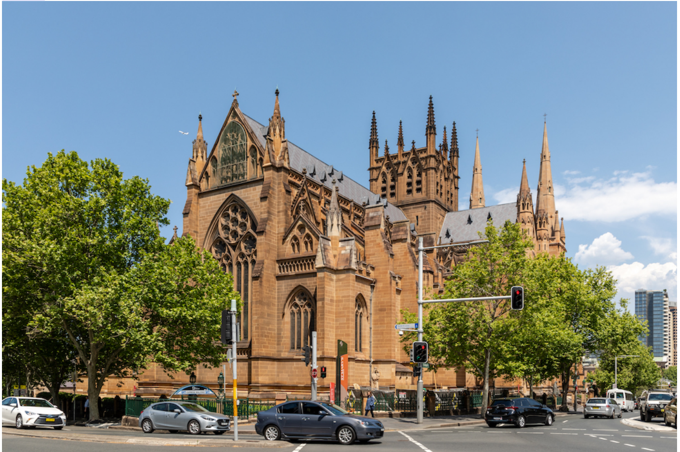
St. Mary's Cathedral, Sydney, New South Wales, Australia, pictured Oct. 25, 2019