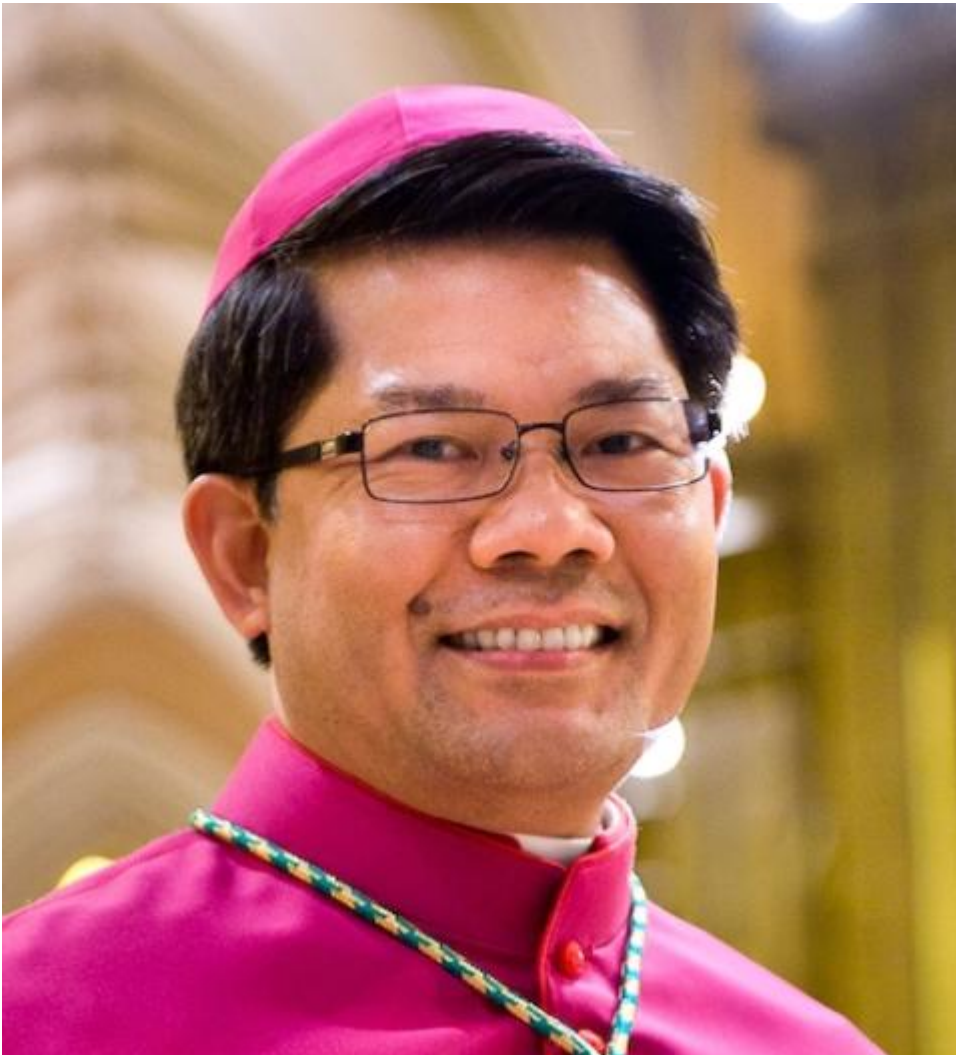
Bishop Vincent Long Van Nguyen, 2014

Preparation for the council got underway in 2018 with a 10-month "listening and dialogue" process that organizers say involved meetings among 222,000 Australian Catholics, which then resulted in some 17,500 submissions about how people view the current reality of the church.