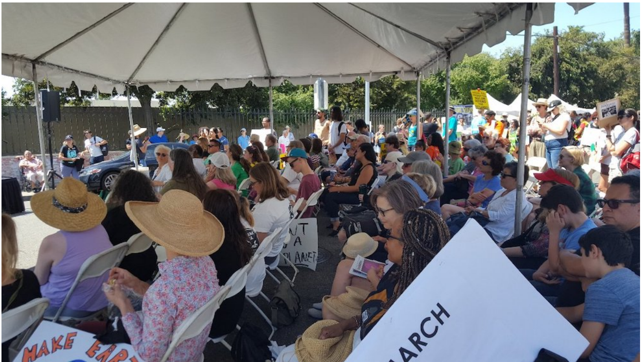
Participants take part in a rally Sept. 8, 2018, opposing oil drilling at the AllenCo Energy facility in Los Angeles' University Park neighborhood.