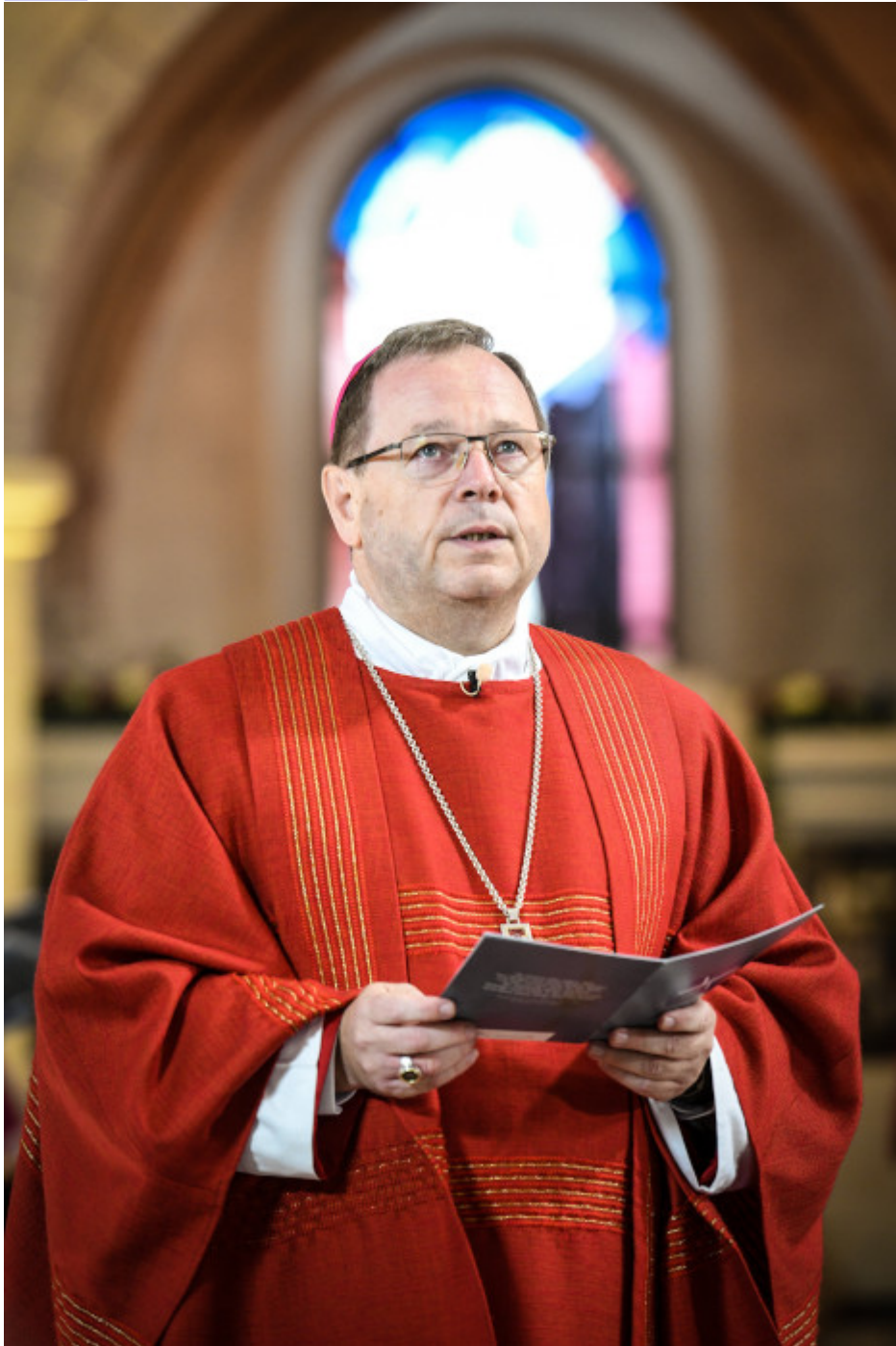
Limburg Bishop Georg Batzing, president of the German bishops' conference, is pictured in a 2019 photo.