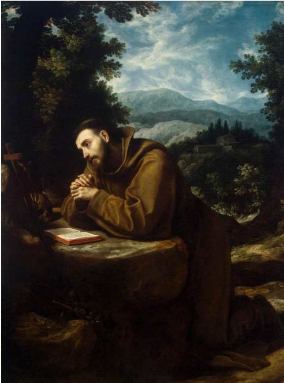
St. Francis of Assisi by Cigoli