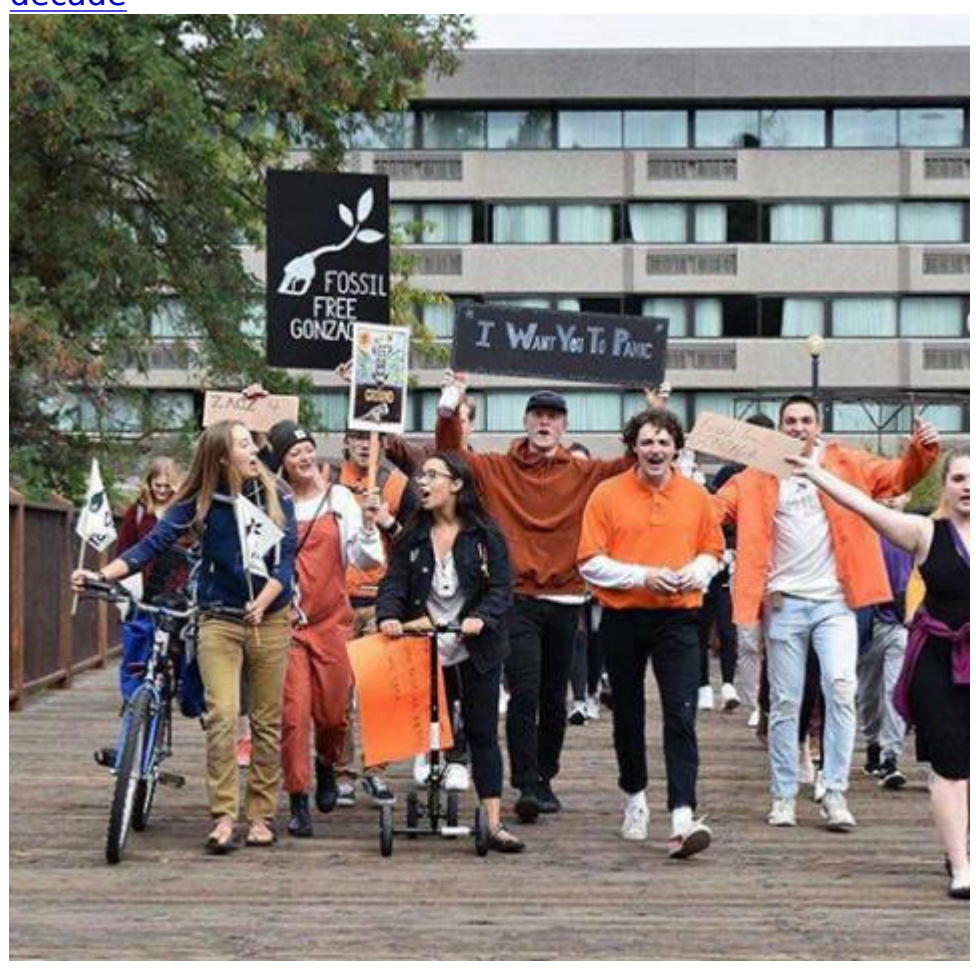
Related: Vatican office invites church on journey to 'total sustainability' in next decade

Even in this year of horrors, we won't soon forget watching Australia burn at Christmas. In the decade past we've watched the Great Barrier Reef — largest living structure on planet Earth — become half as living, lobotomizing a whole chunk of God's brain. We've watched half the sea ice in the Arctic melt, and the ocean become sharply more acidic; we've seen bigger storms and deeper droughts. And all that's with one degree Celsius of global warming. Unless we immediately flatten the carbon curve we're headed for 3 degrees, and with it an almost impossible circumstance for what we call civilization. Everything is on the line.