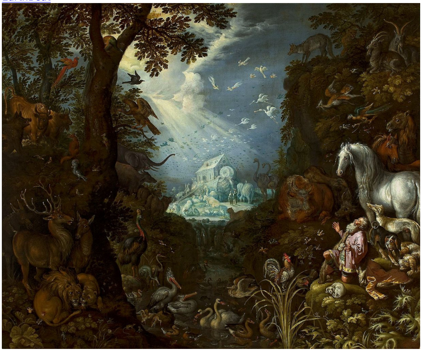
Noah's Ark by Roelant Savery