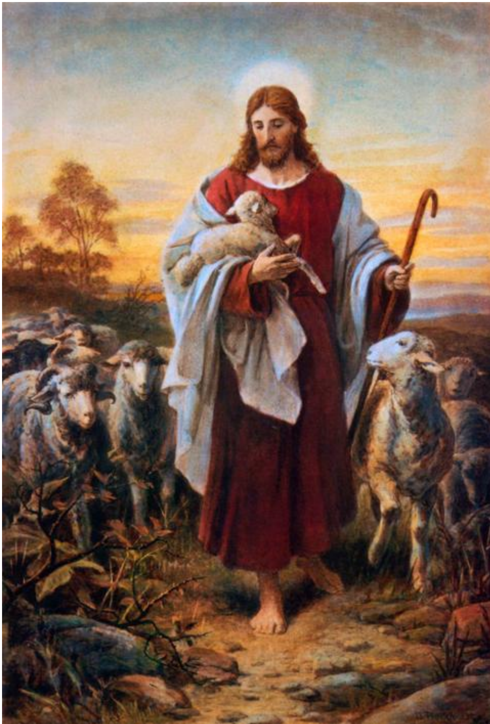
Good Shepherd by Bernhard Plockhorst