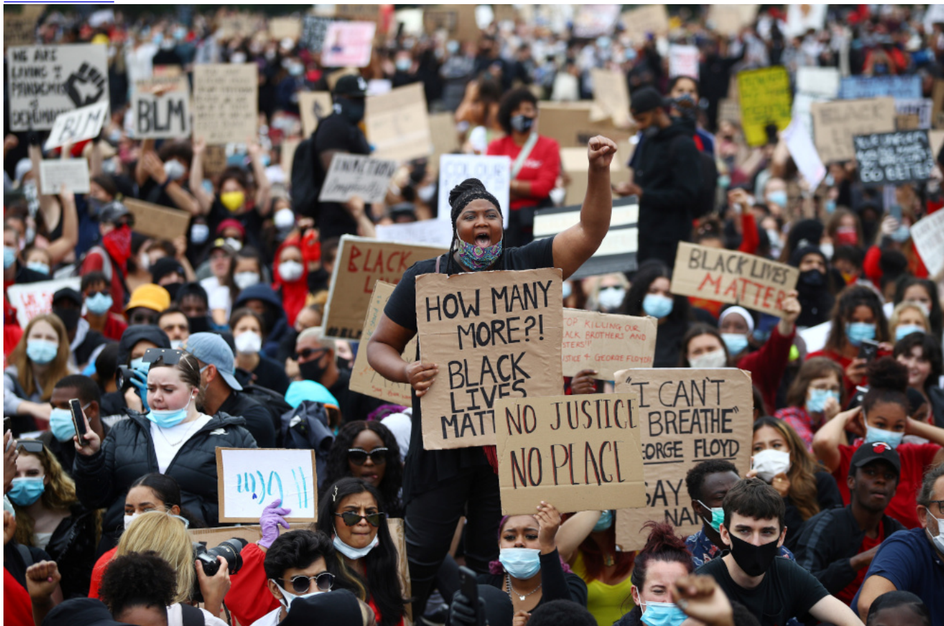
Black Lives Matter protest June 3, 2020, in London.