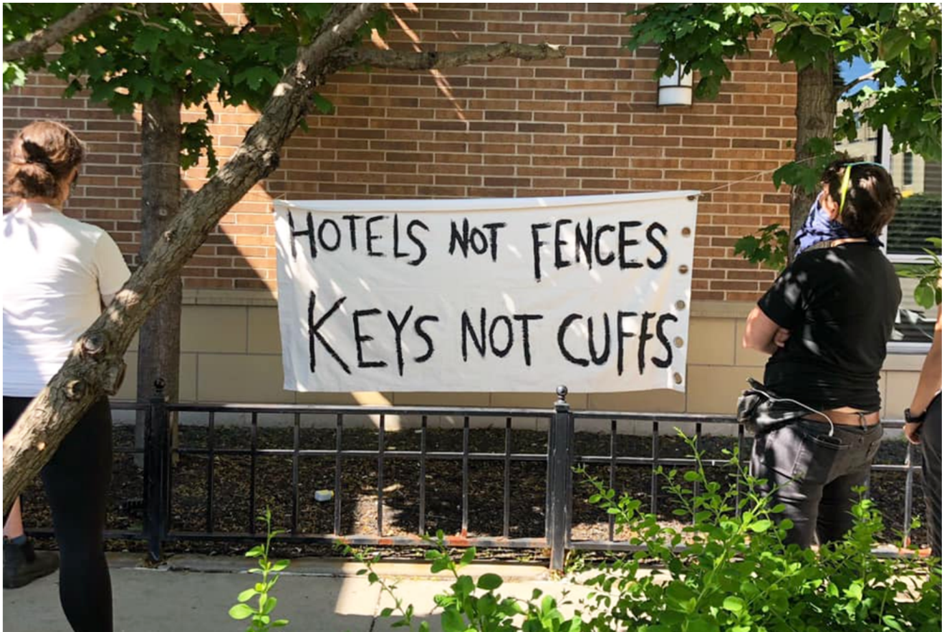
A sign hangs outside the former Sheraton at Chicago Avenue and Lake Street in Minneapolis, in support of the hotel-turned-shelter.

One of the most ambitious community projects in Minneapolis at the moment sits on the corner of Chicago Avenue and East Lake Street, pretty much at the epicenter of the past week's violence, inside what used to be a Sheraton hotel. There, hundreds of volunteers, under the direction of no official organization, have been working quickly to turn the building into a fully functioning homeless shelter, capable of caring for more than 200 people.