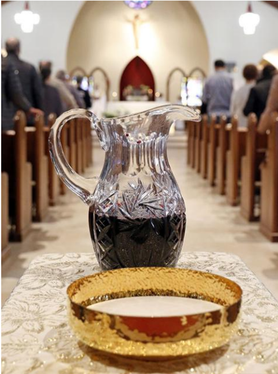
A ciborium containing hosts and a flagon of wine are seen during Mass April 23, 2017, at St. Therese of Lisieux Church in Montauk, New York.

This pope, just like those who held the chair of Peter before and after him, is concerned that people are trying to debate the legitimacy of the teaching. Indeed, there are many in this camp, Catholics who believe the teaching is unjust, disagree with its theological reasoning, or advocate for a more inclusive sacrament. I can understand why the pope, as one tasked with preserving church teaching, would feel threatened by such calls for change. But debates and dialogues are different.