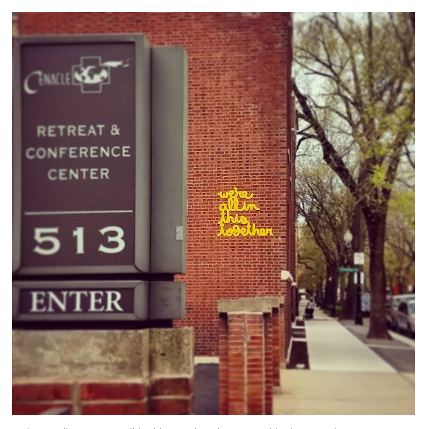
A sign reading "We are all in this together" hangs outside the Cenacle Retreat & Conference Center in Chicago

In keeping with our mission, each year the Cenacle would welcome over 7,500 persons. They came from religious communities, non-profit boards of directors, social justice committees and parish groups. We, like thousands of other retreat centers across the world, provide the space for people of all walks of life to go out and do justice, love mercy and transform our world. Whoever they are, they are