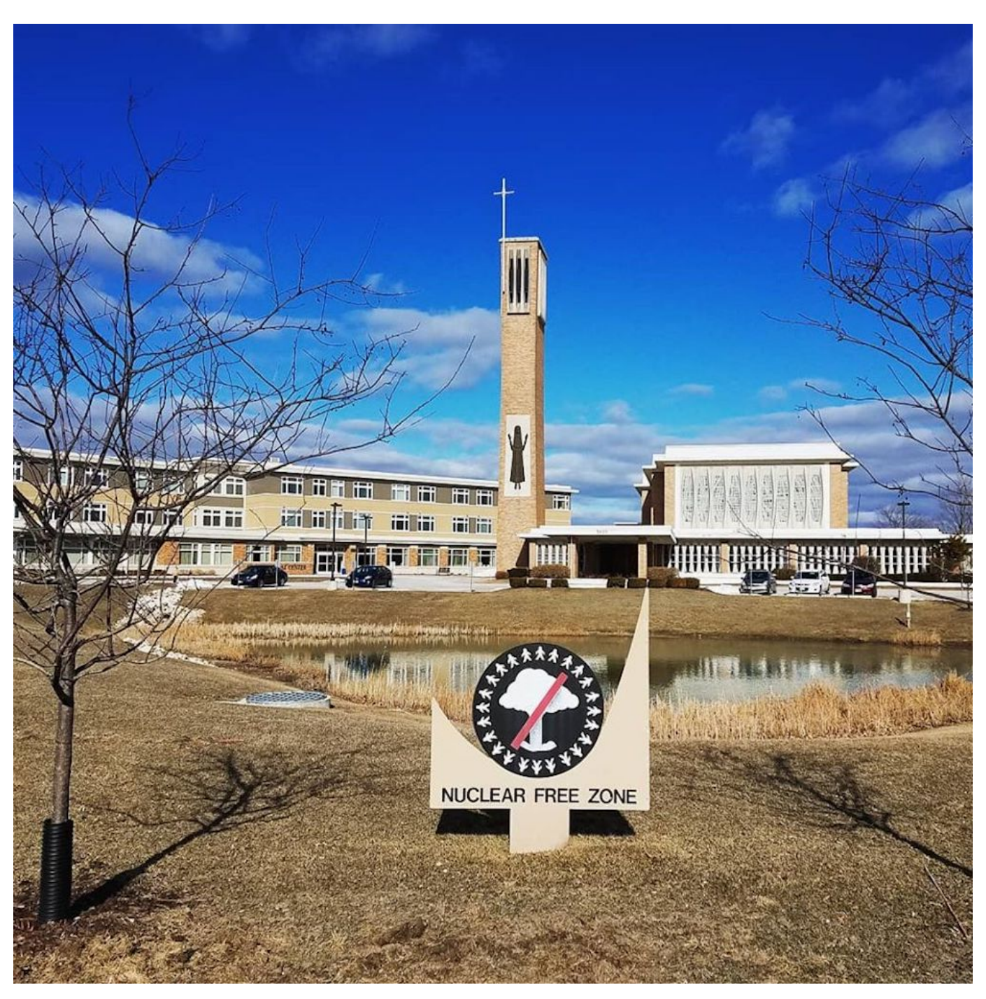
Siena Retreat Center in Racine, Wisconsin (Mark Piper)

Not all retreat centers were eligible for the <u>Paycheck Protection Program</u>. Many centers affiliated with the Retreat Center Collaboration did apply and did receive funds. It's clear that even after it is safe to reopen, after the Paycheck Protection Program runs out, many retreat centers will provide diminished or reduced ministries. It's also very likely some centers may simply be unable to recover from this, and temporary closures will become permanent closures.