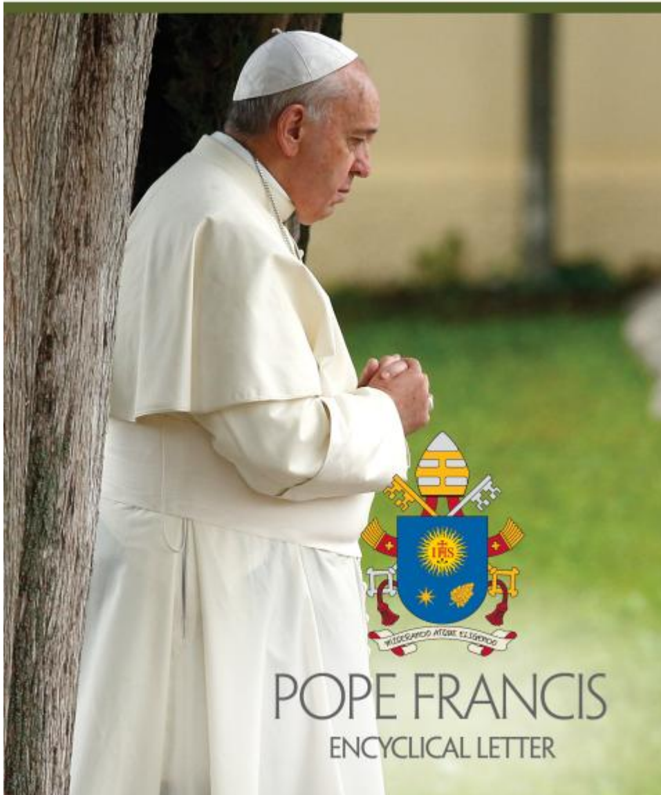
Cover of the English edition of "Laudato Si', on Care for Our Common Home."