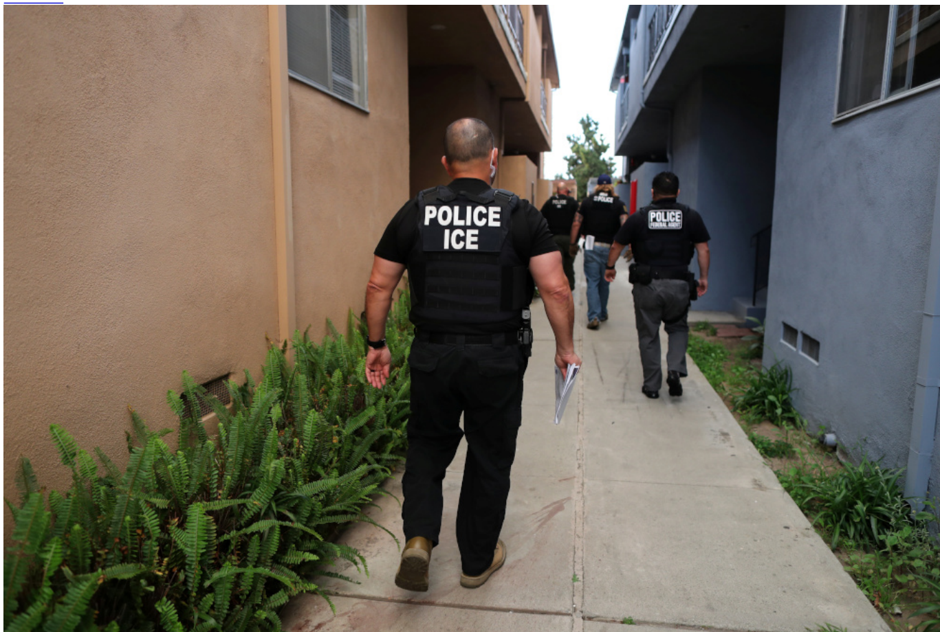
U.S. Immigration and Customs Enforcement personnel are seen in Hawthorne, Calif., March 1, 2020.