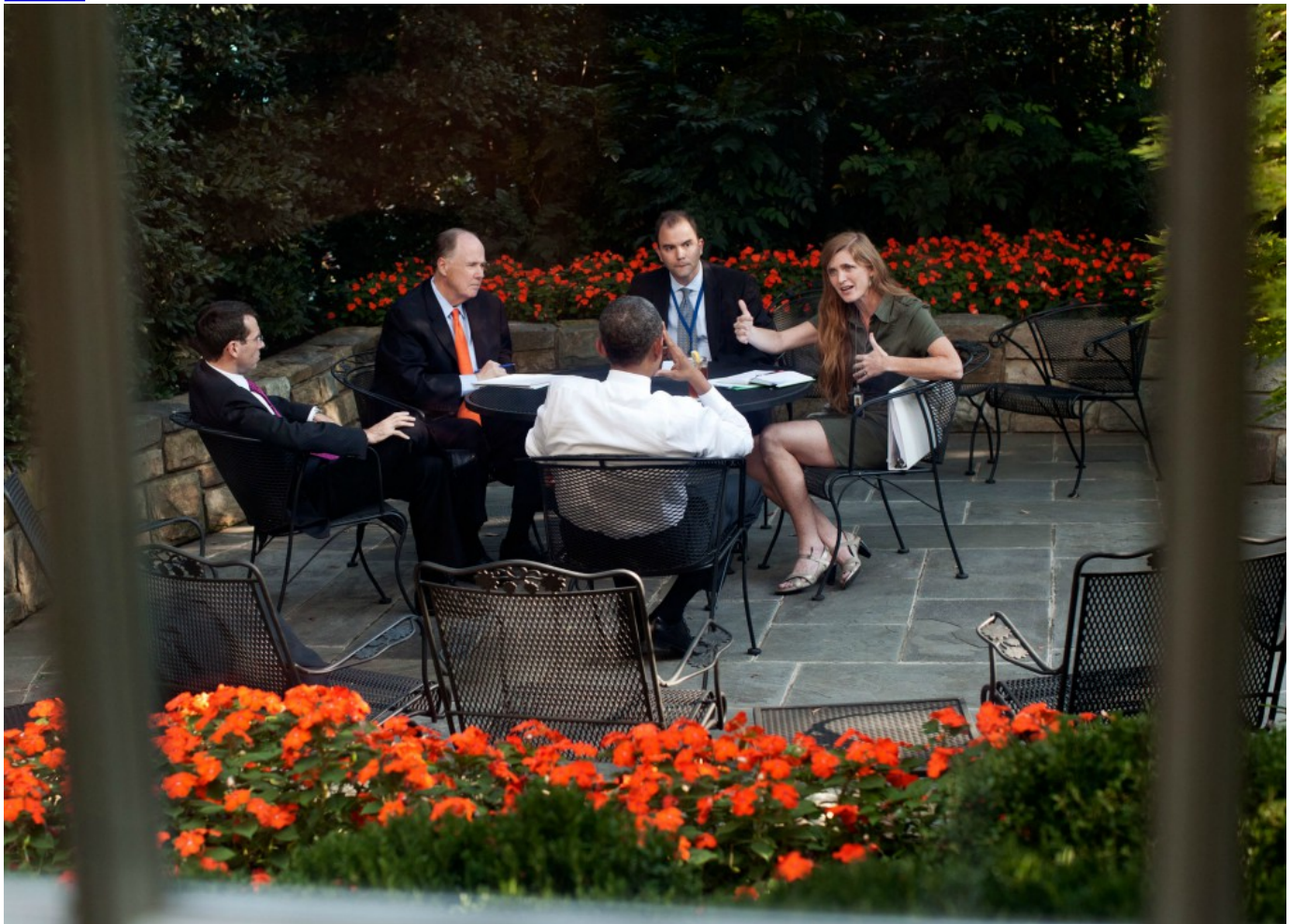
President Barack Obama meets with advisers, including Samantha Power (right), on the patio outside the Oval Office, Sept. 14, 2011.