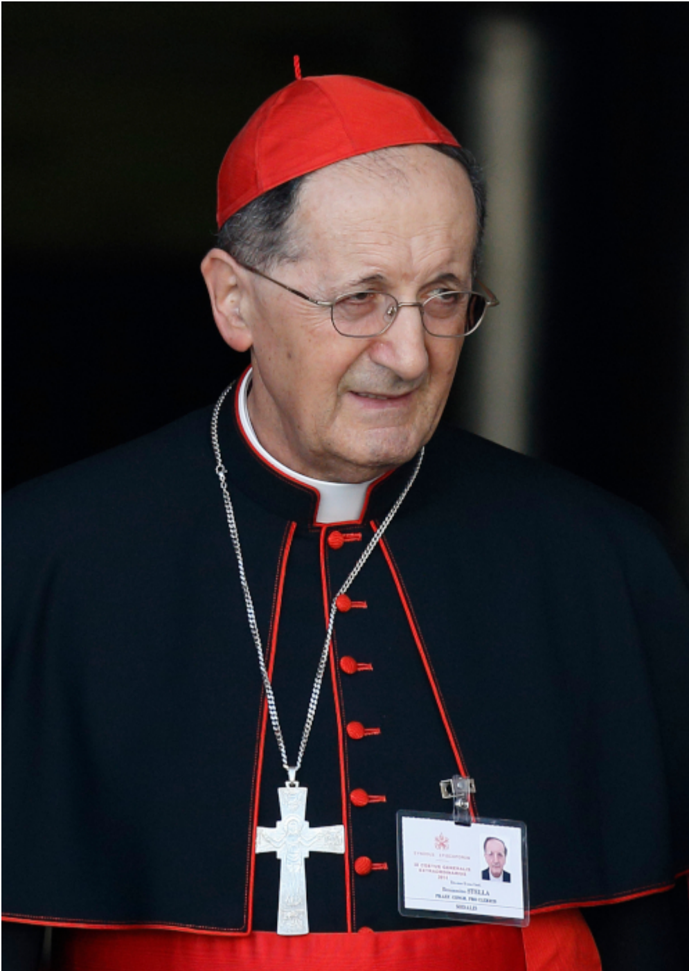
Cardinal Beniamino Stella, prefect of the Congregation for Clergy, is seen at the Vatican in this 2014 photo. Cardinal Stella says a Vatican document underlines how parishes are not "businesses" that can be led by anyone.