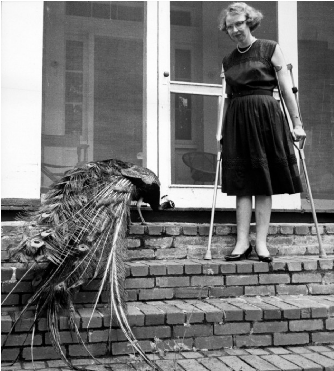
Catholic writer Flannery O'Connor is seen in an undated photo.