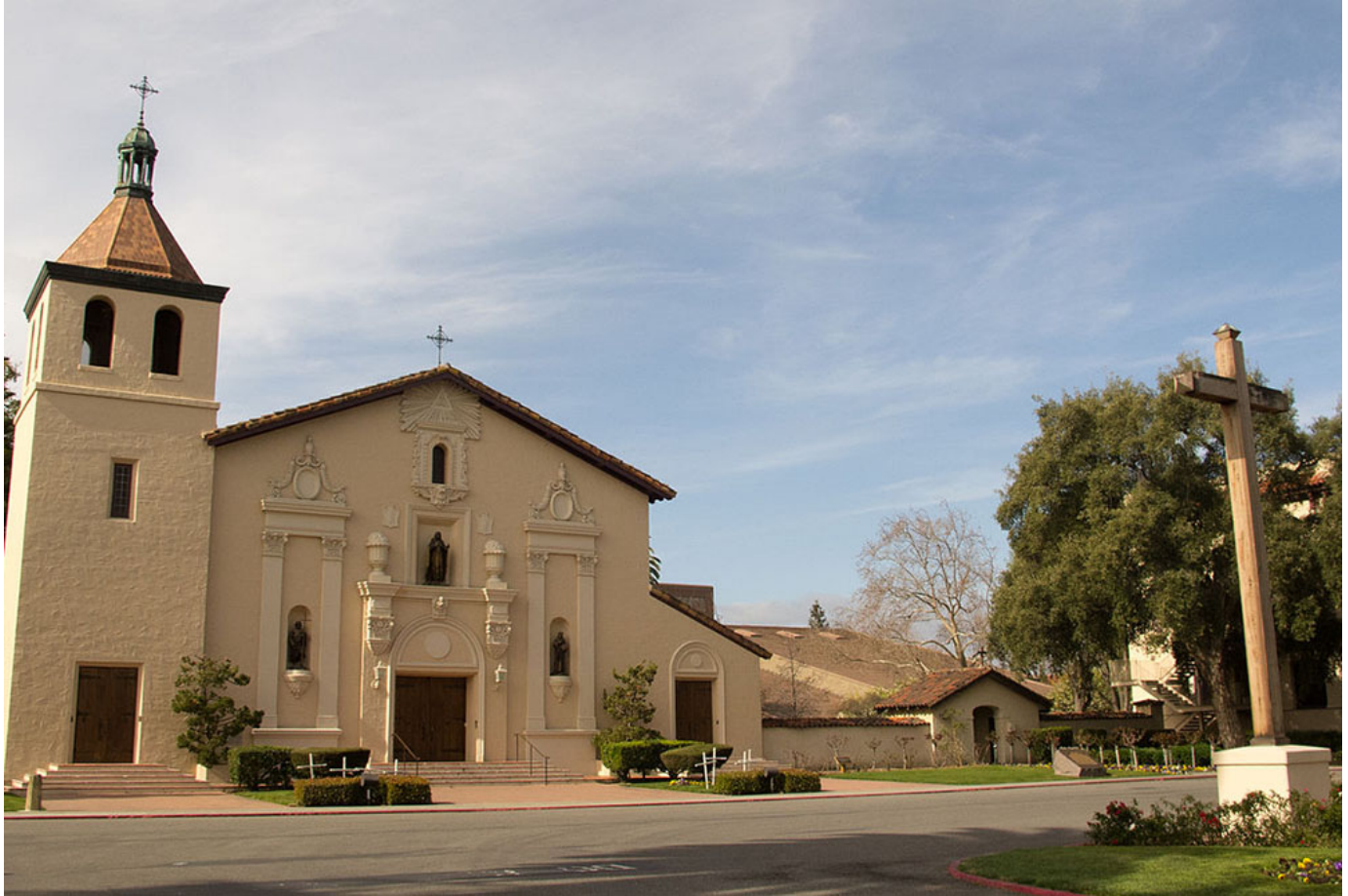
The Santa Clara Mission Church at Santa Clara University