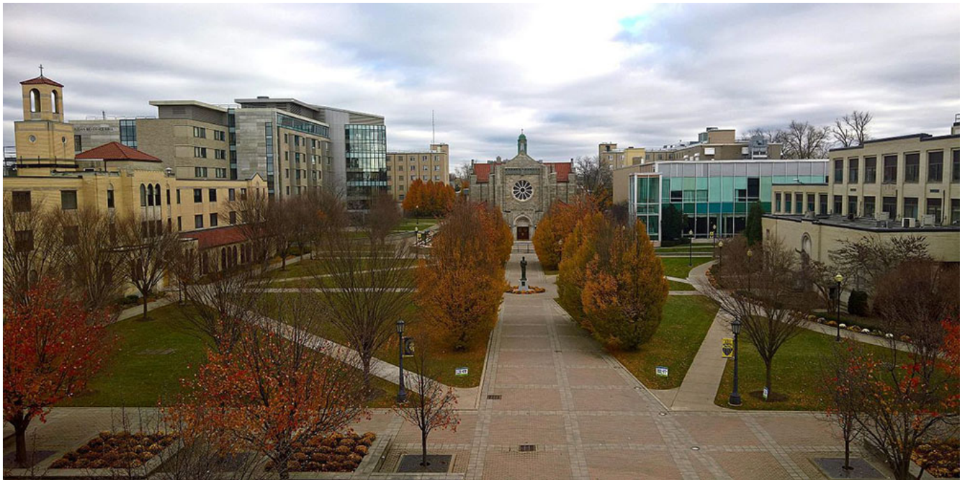
The quad at Canisius College in Buffalo, New York