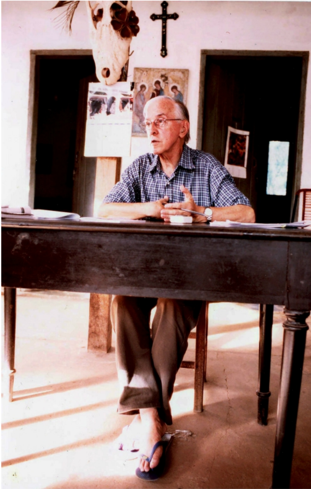
Retired Bishop Pedro Casaldáliga in an undated photo.