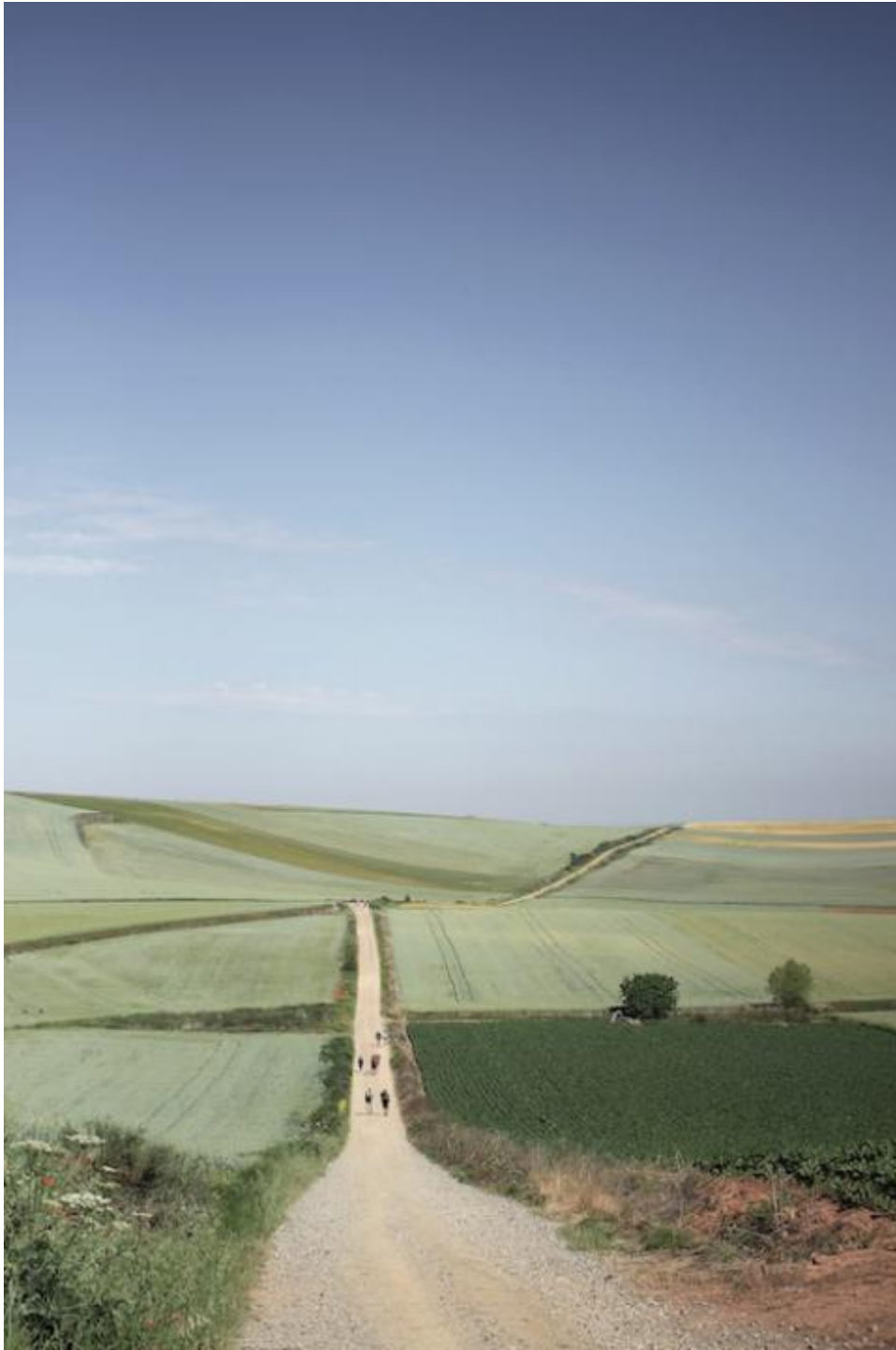
Camino de Santiago

There are advantages to armchair pilgrimages. No bleeding blisters on my feet nor aching arches. No worries about finding a place to bed down for the night. Sipping my morning coffee in the comfort of my own well-worn armchair as I go on pilgrimage within the confines of my own home is, by comparison, a treat.