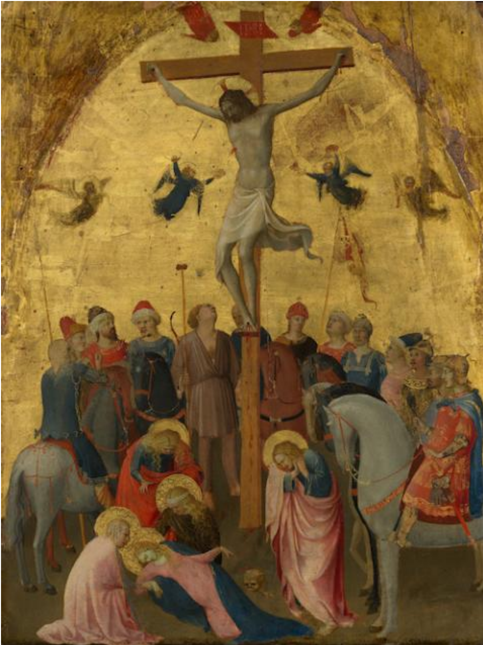
Detail of painting "The Crucifixion" by Fra Angelico (Guido di Pietro), circa 1420-23 (Metropolitan Museum of Art)

But this type of thinking has percolated in Catholic circles for a while. Couples who opt to use natural family planning (or NFP), and find it difficult or damaging, are often admonished for failure of faith — just as Deacon Poyo accused those who have been taking precautions of "living in fear."