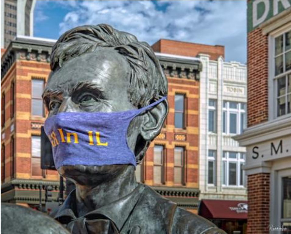
Statue of President Abraham Lincoln with "All in Illinois" mask, Springfield Old State Capitol Plaza, April 8

portrays God as being on the side of the Union Army, his "righteous sentence" visible by the "dim and flaring lamps" of the encamped troops. In his second inaugural address , Lincoln raises the possibility of slavery being "one of those offences which, in the providence of God, must needs come, but which, having continued through His appointed time, He now wills to remove."