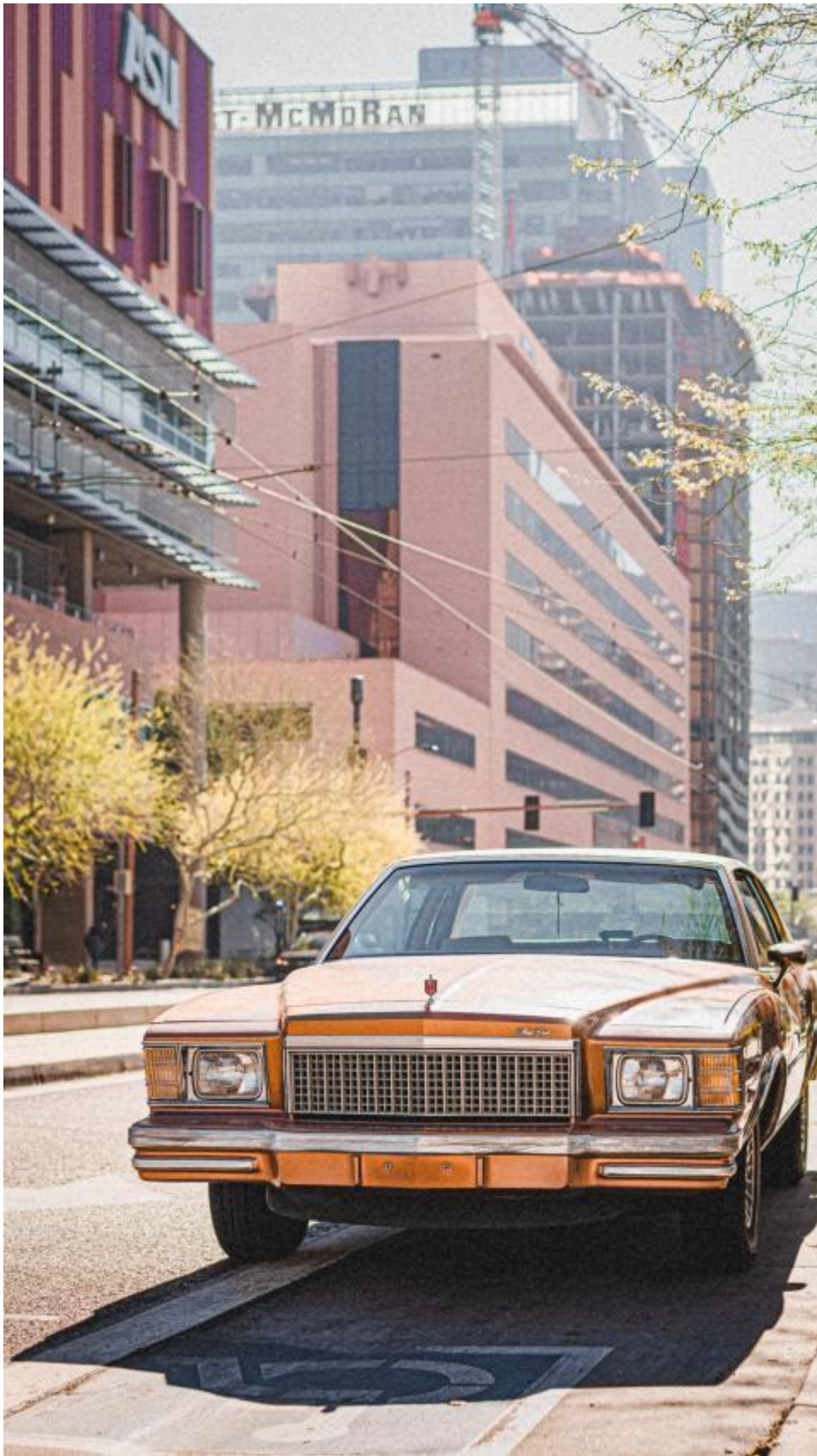
Downtown Phoenix, Arizona outside an Arizona State University building. This June, Phoenix's Street Transportation Department fast-tracked a "cool pavement" pilot