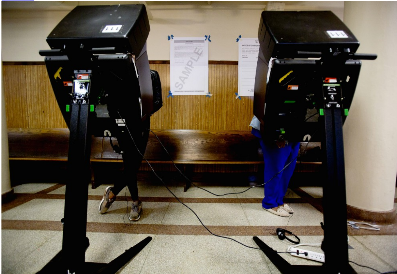
People vote in the John Bailey Room at St. Francis Xavier Church in Washington, D.C., Nov. 8, 2016.