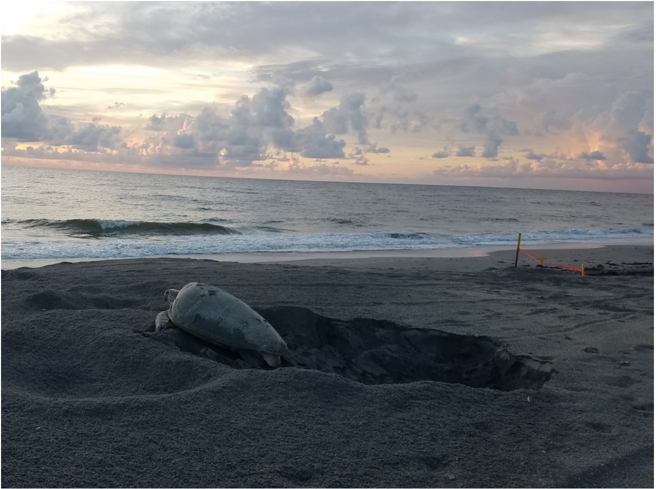
A green sea turtle, " Chelonia mydas ," heads back to the water after nesting, June 14, 2020.