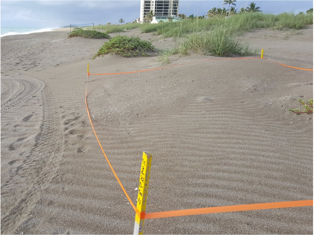
A sea turtle nest is marked by orange tape to protect it from beachgoers. Helped by conservation measures, monitoring and research, sea turtles are still nesting along Florida beaches despite development pressures.