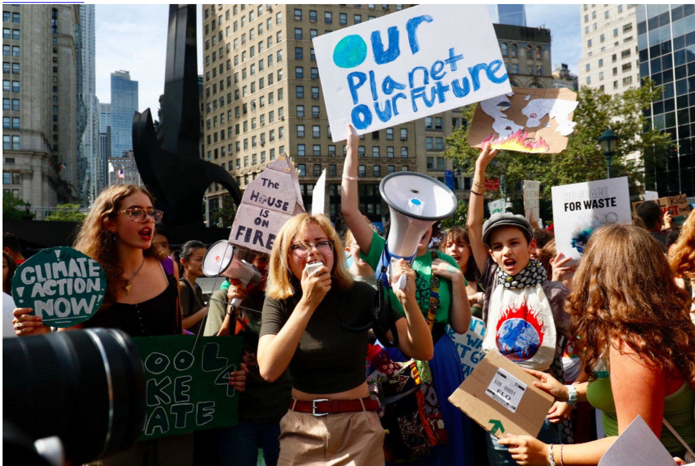
Young people gather for a climate change rally in New York City in September 2019.