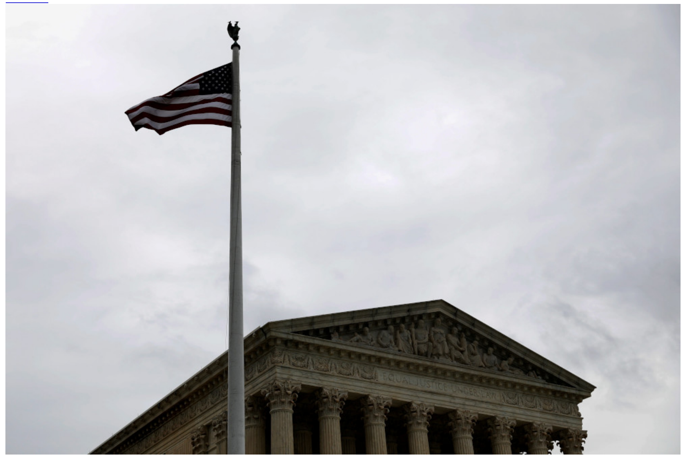
The U.S. Supreme Court is temporarily allowing drugs used to medically induce abortions to be mailed or delivered without requiring the recipient to make a doctor's visit during the coronavirus pandemic.