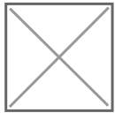
Catholic News Service