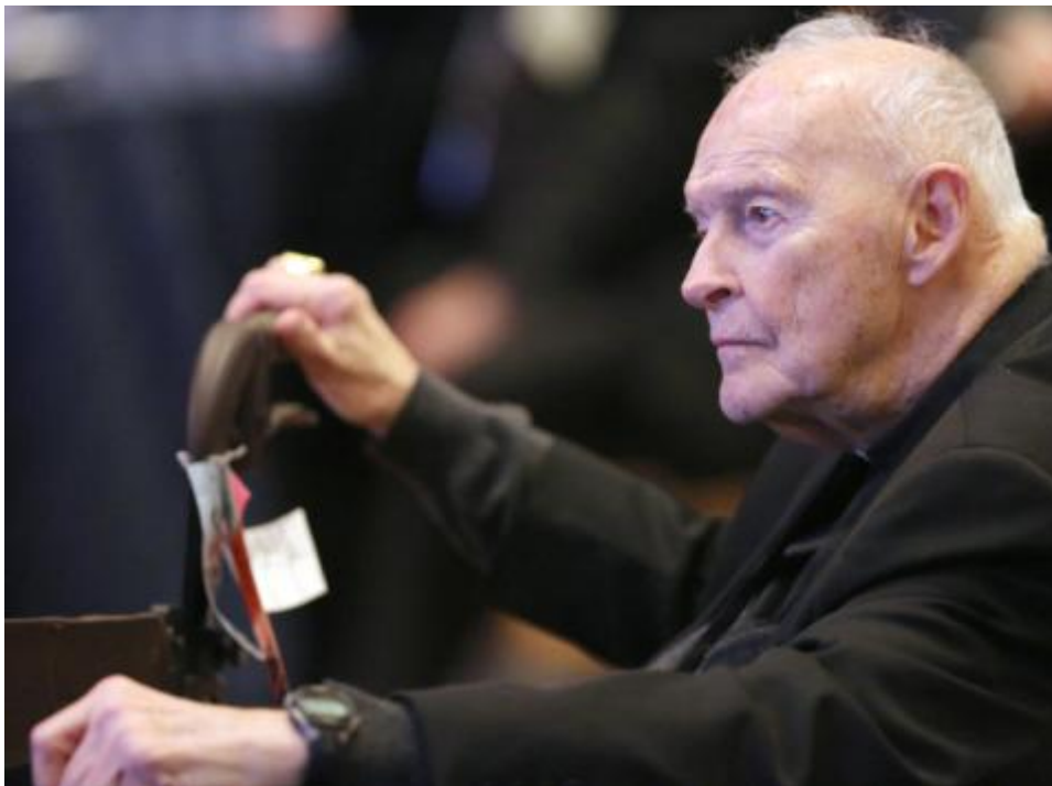
Theodore McCarrick is pictured in Baltimore, Maryland, in 2017.

The Vatican wants to release the document prior to the annual meeting of the U.S. Catholic bishops' conference, which is to be held virtually Nov. 16-17, said an informed Vatican source. The person asked not to be named as they did not have authorization to speak on the matter.