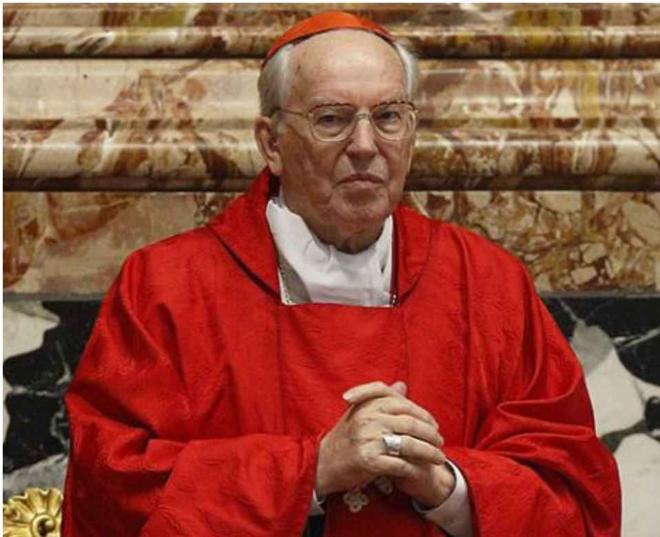
Cardinal Giovanni Battista Re, now dean of the College of Cardinals, in a 2019 photo