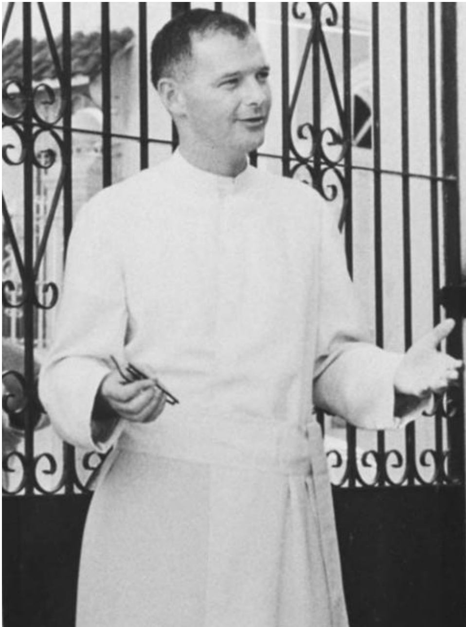
Then-Msgr. Theodore McCarrick, in a 1966 file photo

The only pope of the four who appears to emerge entirely unscathed is Paul VI. The summary states simply that when Paul named McCarrick as an auxiliary bishop in New York in 1977, "no one reported having witnessed or heard of McCarrick engaging in any improper behavior."