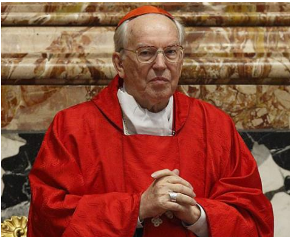
Cardinal Giovanni Battista Re, now dean of the College of Cardinals, in a 2019 photo

"Ultimately, the path of a canonical process to resolve factual issues and possibly prescribe canonical penalties was not taken," states the summary. "Instead, the decision was made to appeal to McCarrick's conscience and ecclesial spirit by indicating to him that he should maintain a lower profile and minimize travel for the good of the Church."