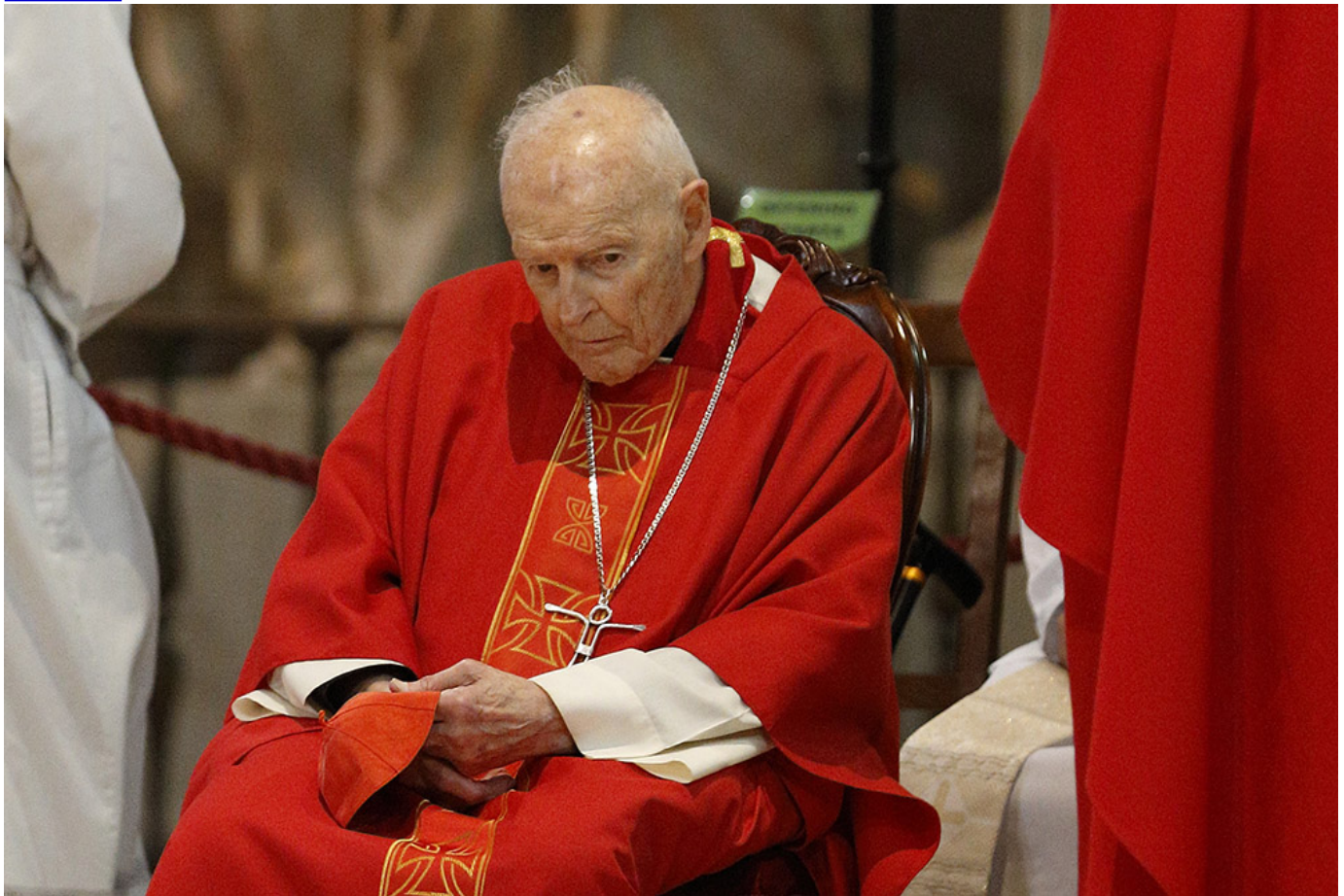
Then-Cardinal Theodore McCarrick attends a Mass April 11, 2018, in Rome.