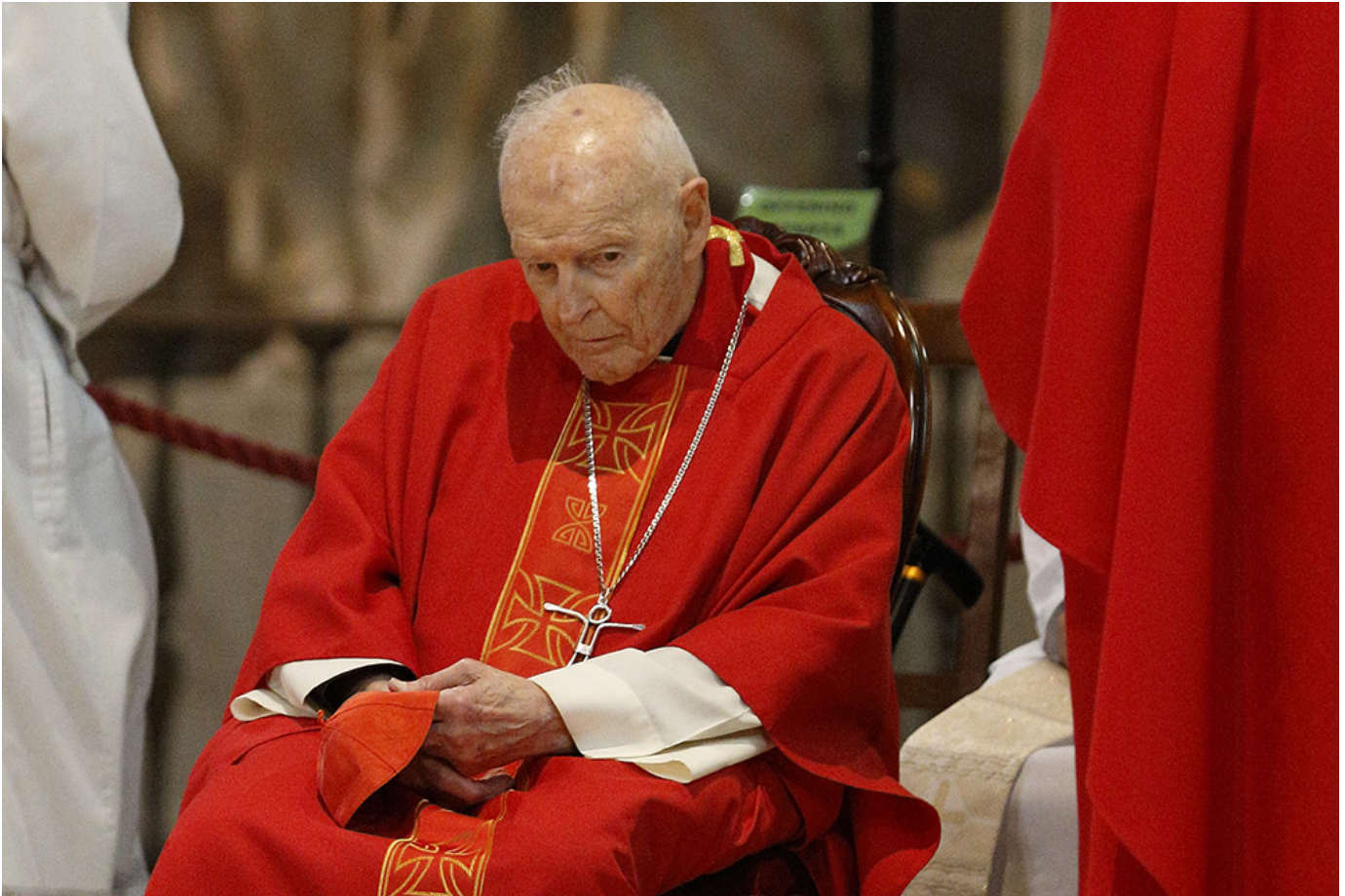
Then-Cardinal Theodore McCarrick attends a Mass April 11, 2018, in Rome.