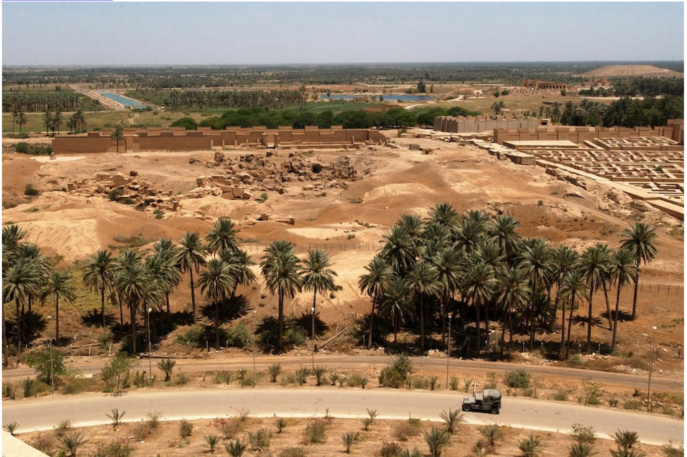
View of Hillah, Iraq, in the central part of the country and near ancient Babylon