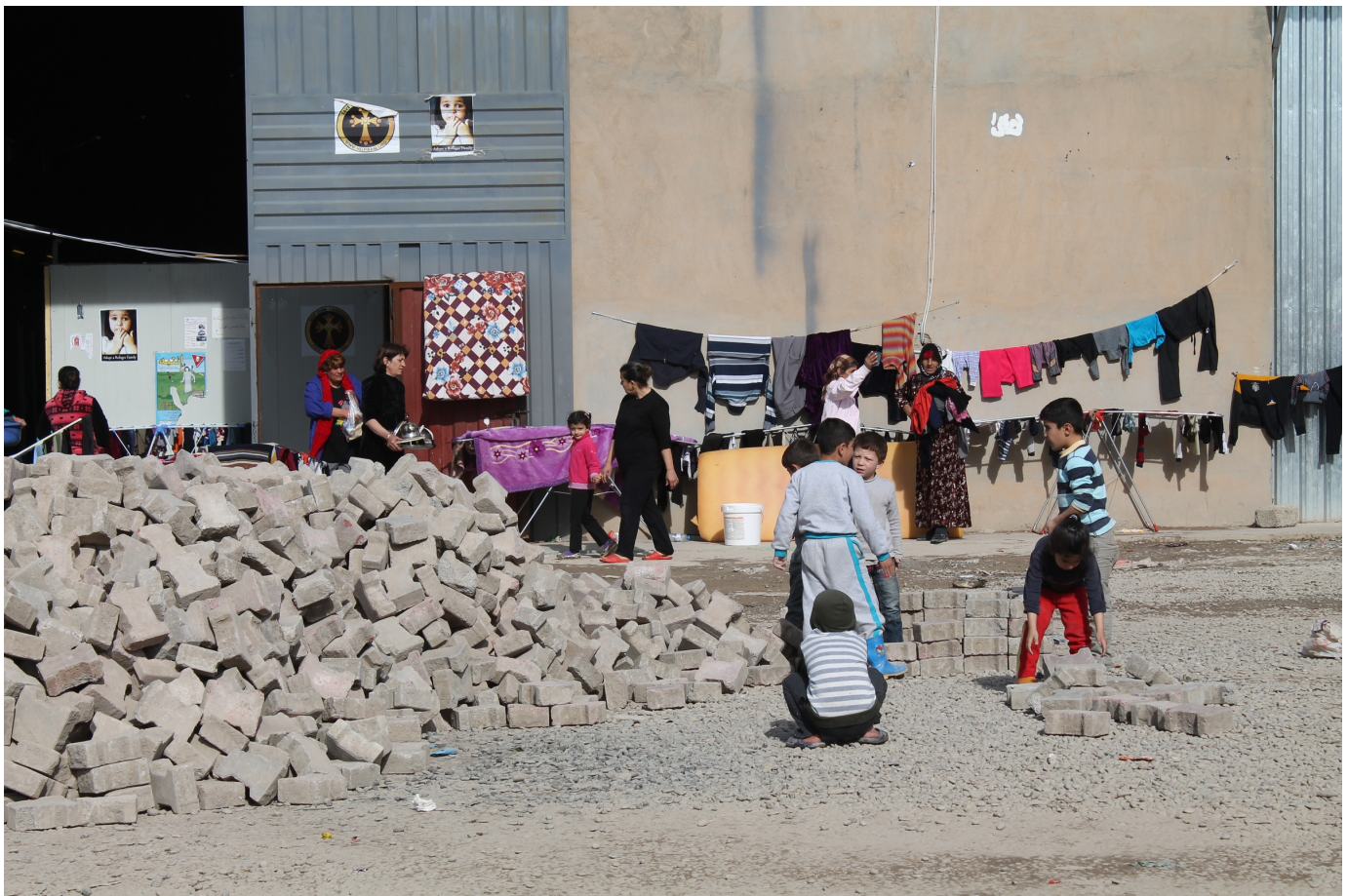
Iraqi Christian children play with concrete blocks Jan. 21, 2015, in a camp, new at the time, set up for the displaced on the outskirts of Ainkawa, Iraq.

While serving in Iraq, she and her team were told not to stop for civilians on the roads even if they were children. This might entail running over an Iraqi child in order to keep the convoy of U.S. soldiers moving to avoid being ambushed by enemy soldiers, but that was her job. After all, she was a soldier and had pledged her allegiance to a nation she had sworn to protect and defend. If this meant killing innocent Iraqi civilians, so be it.