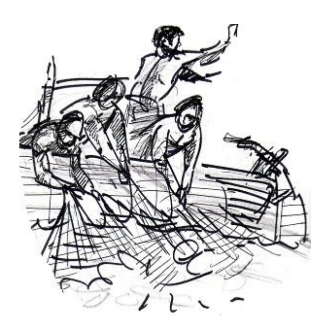
"Then he called them" (Mark 1:20)