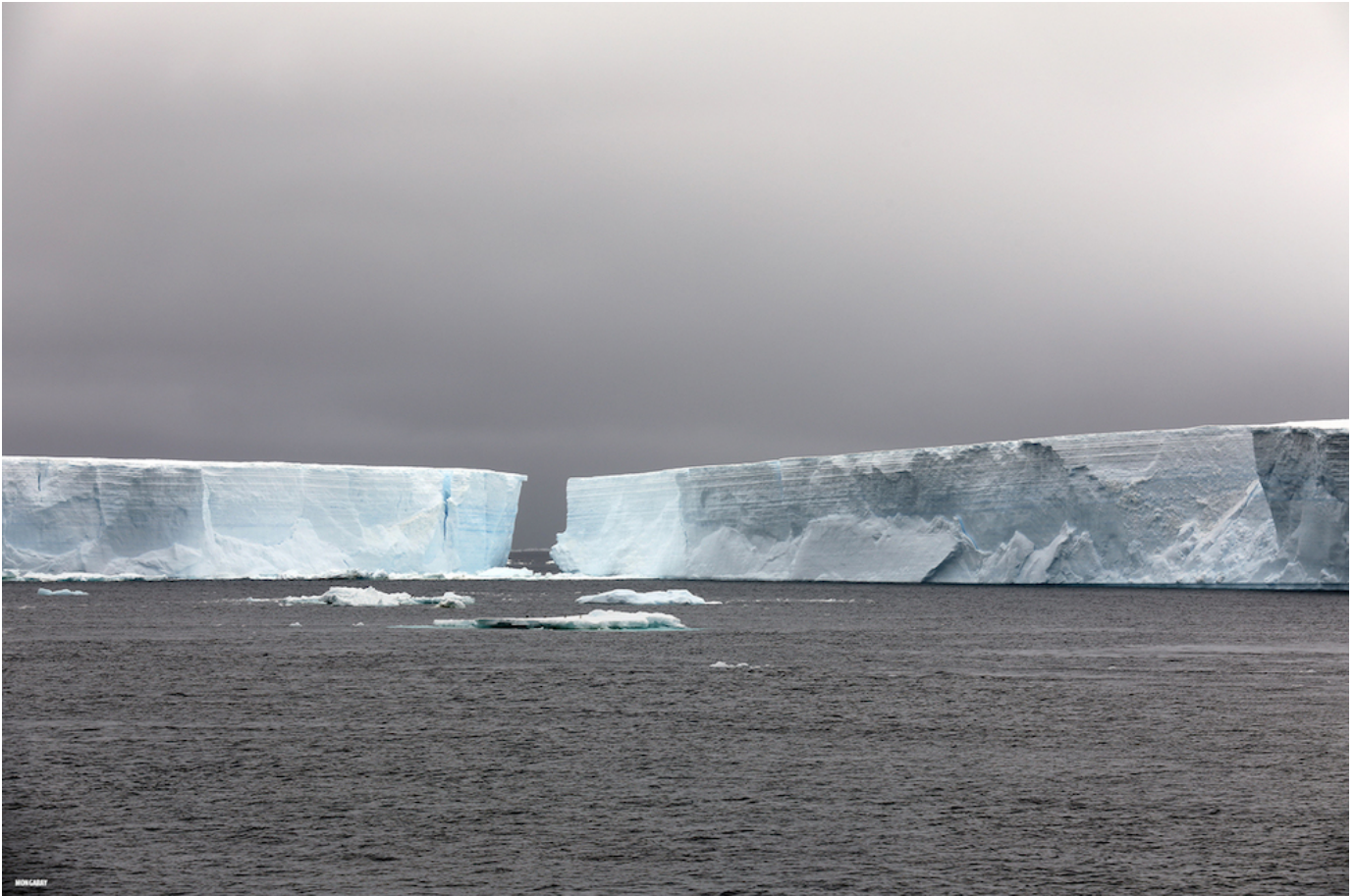
Glaciers and icebergs in Antarctica

life-support system. My proposal with Bruno Latour is that we could in principle add a bit of self-awareness to the Earth's self-regulation. At the very least we could sense where things are going wrong better (through satellites etc) and correct our mistakes faster. We could also use the prior Gaia to provide a template for designing a more flourishing sustainable future — including sustainable energy, material recycling, and horizontal information exchange, supporting a rapid learning process.