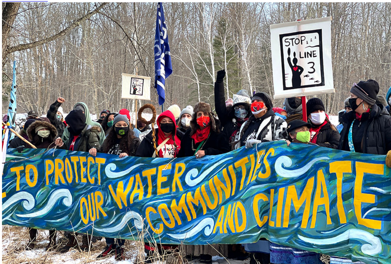
Protesters demonstrate against the Enbridge Line 3 Pipeline in northwestern Minnesota on Dec. 17, 2020.