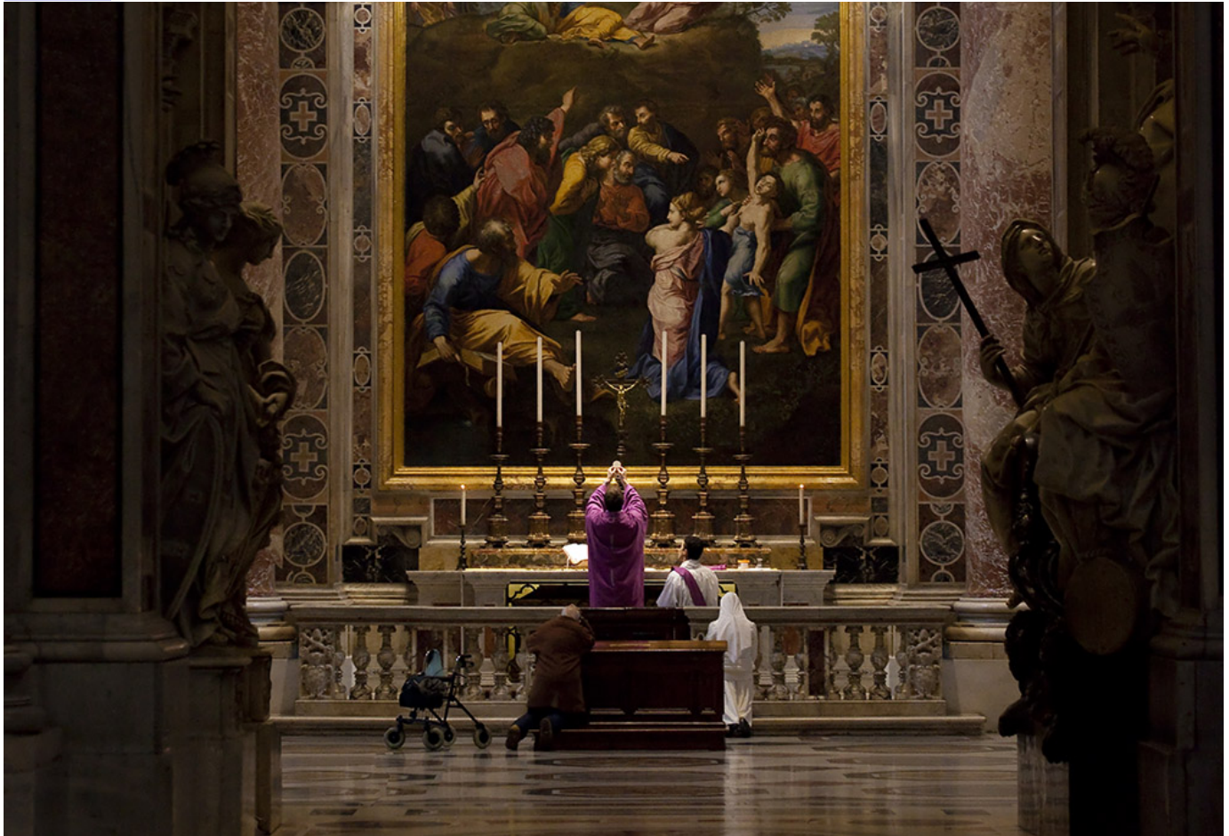
The Altar of the Transfiguration in St. Peter's Basilica at the Vatican in February 2013