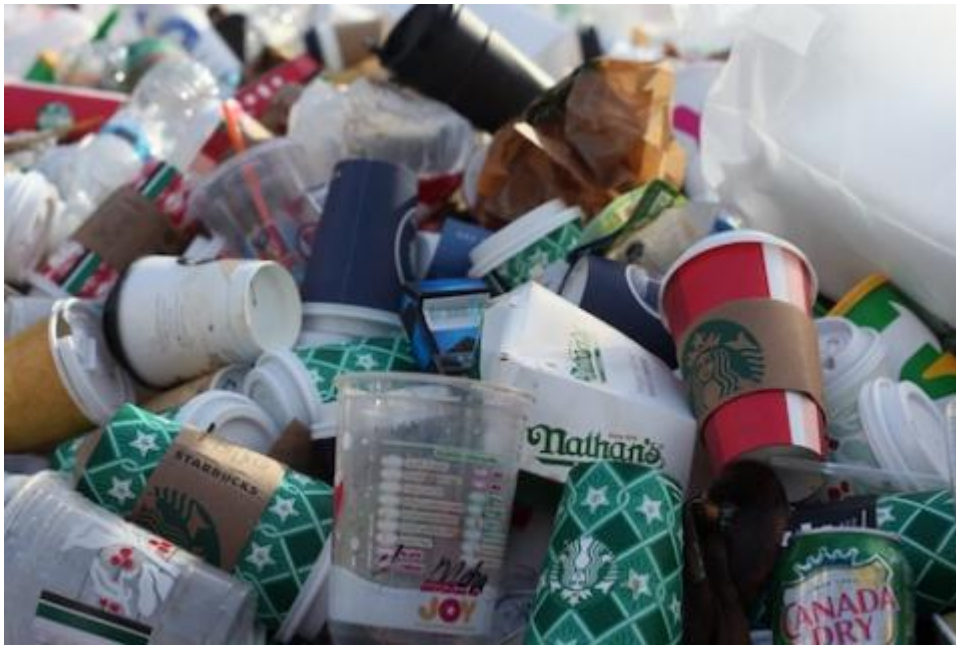
Pile of discarded single use containers, mostly coffee cups

"It's not enough to just talk about the principles. There have to be strategies and campaigns and movements to enact and operationalize those," he said.