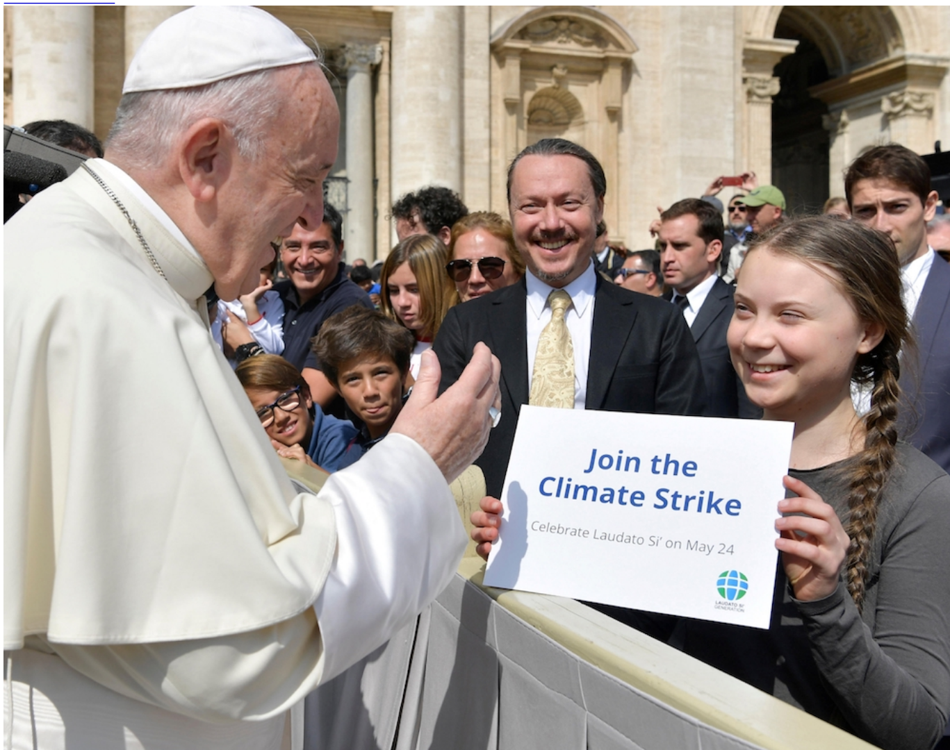
Pope Francis greets Swedish climate activist Greta Thunberg during his general audience in St. Peter's Square at the Vatican April 17, 2019.