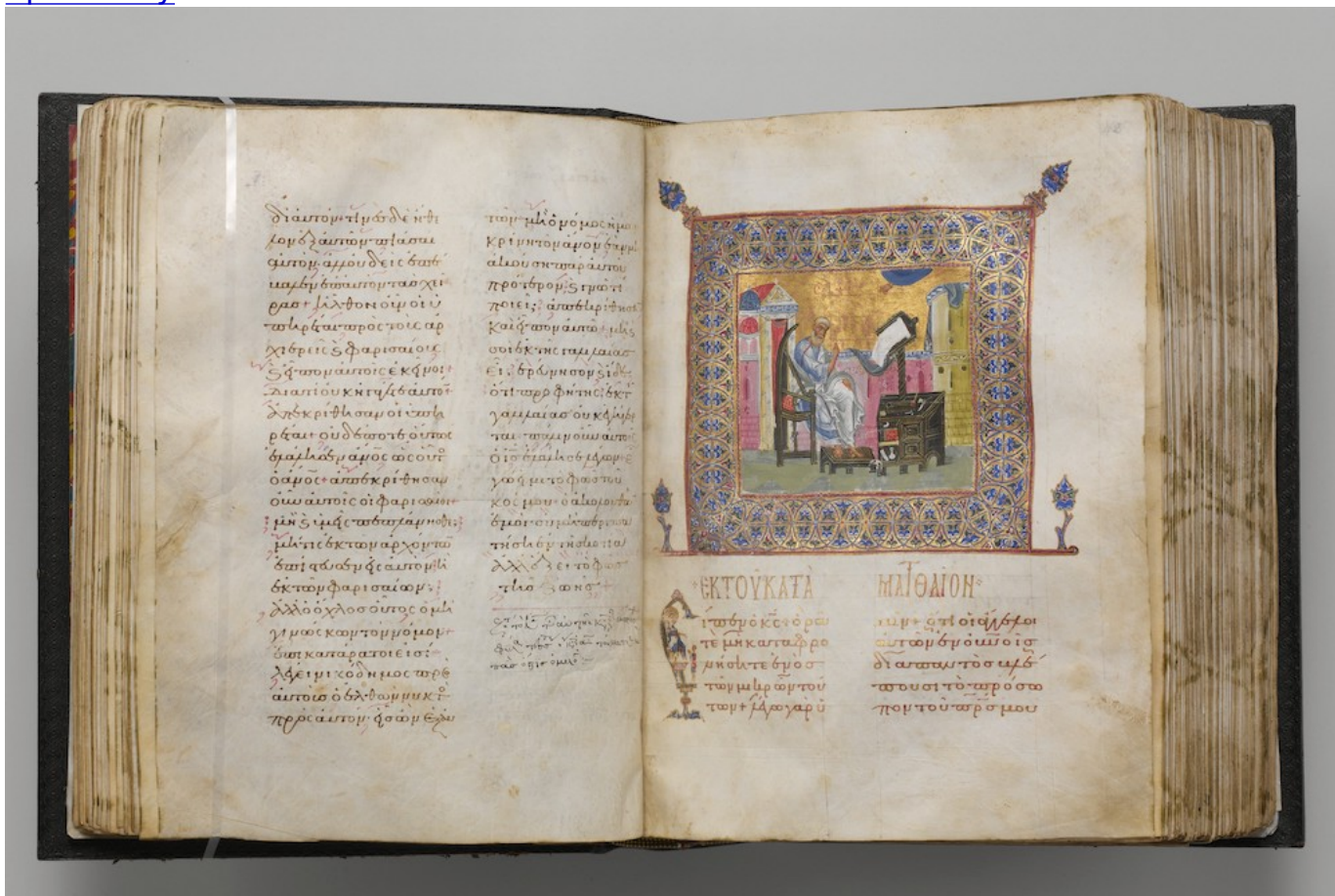
Jaharis Byzantine Lectionary, circa 1100 and made in Constantinople, open to folio 43 showing the evangelist Matthew (Metropolitan Museum of Art)

Opinion Spirituality Vatican Spirituality